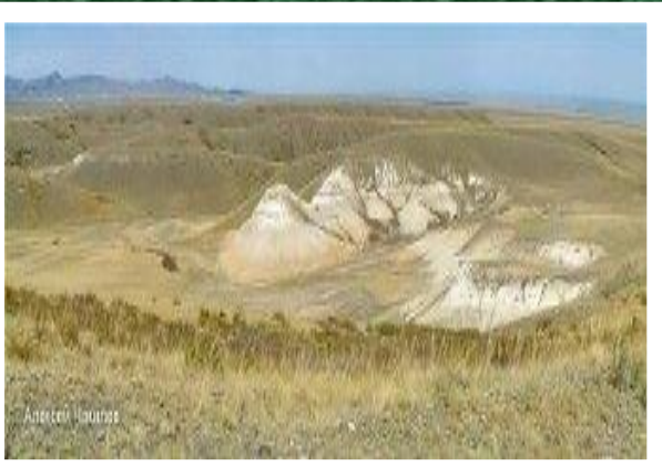
Tarbagatai State Nature Reserve