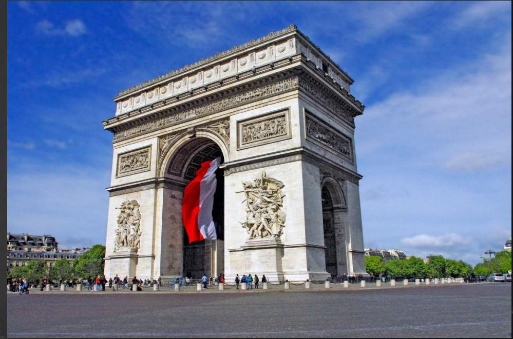
Arc de Triomphe