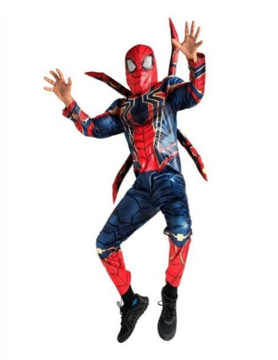
New year costume