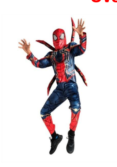
New year costume