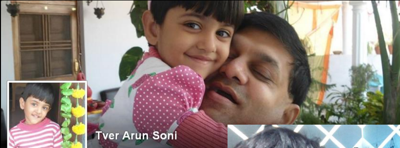
Tver Arun Sony