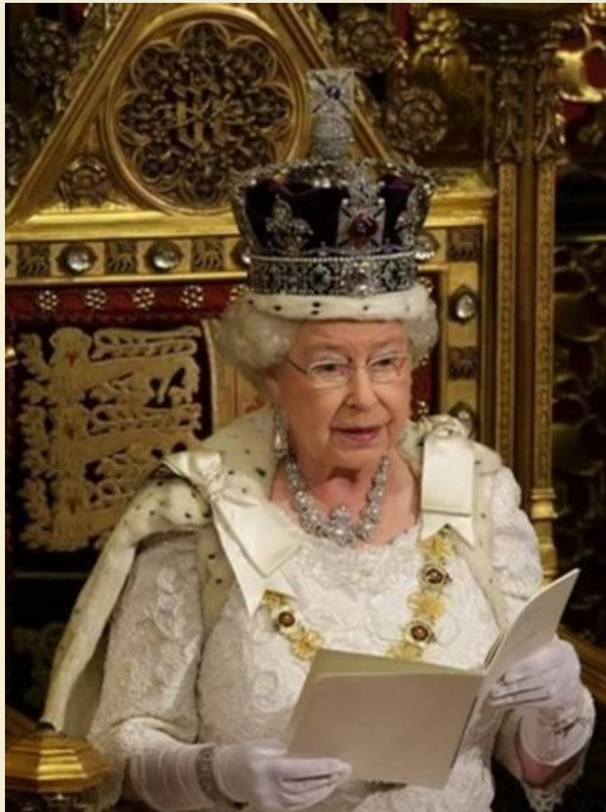
The official ceremony the State Opening of Parliament