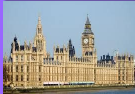
The Houses of Parliament