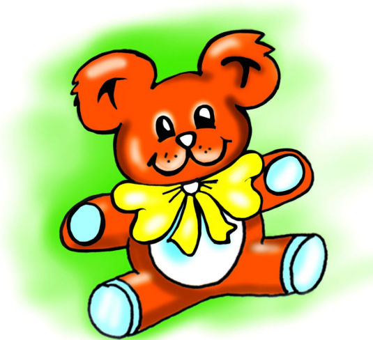
a teddy bear