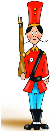
a toy soldier