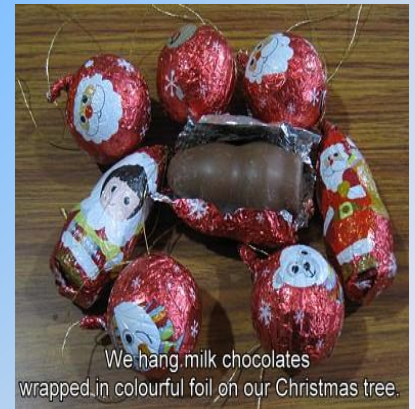
We hang milk chocolates wrapped in colourful foil on our Christmas tree.