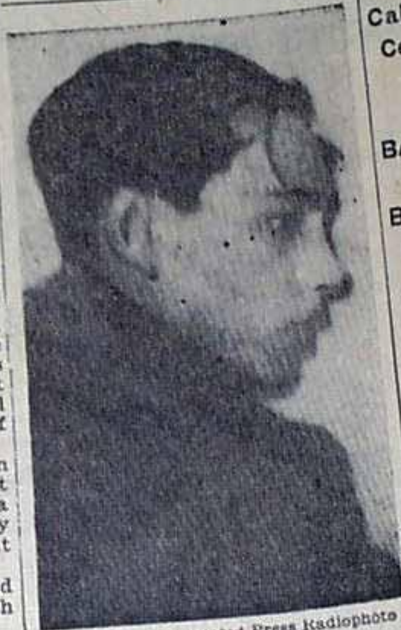
Herschel Grynszpan

According to a postal card mailed from the German-Polish frontier on Oct. 31