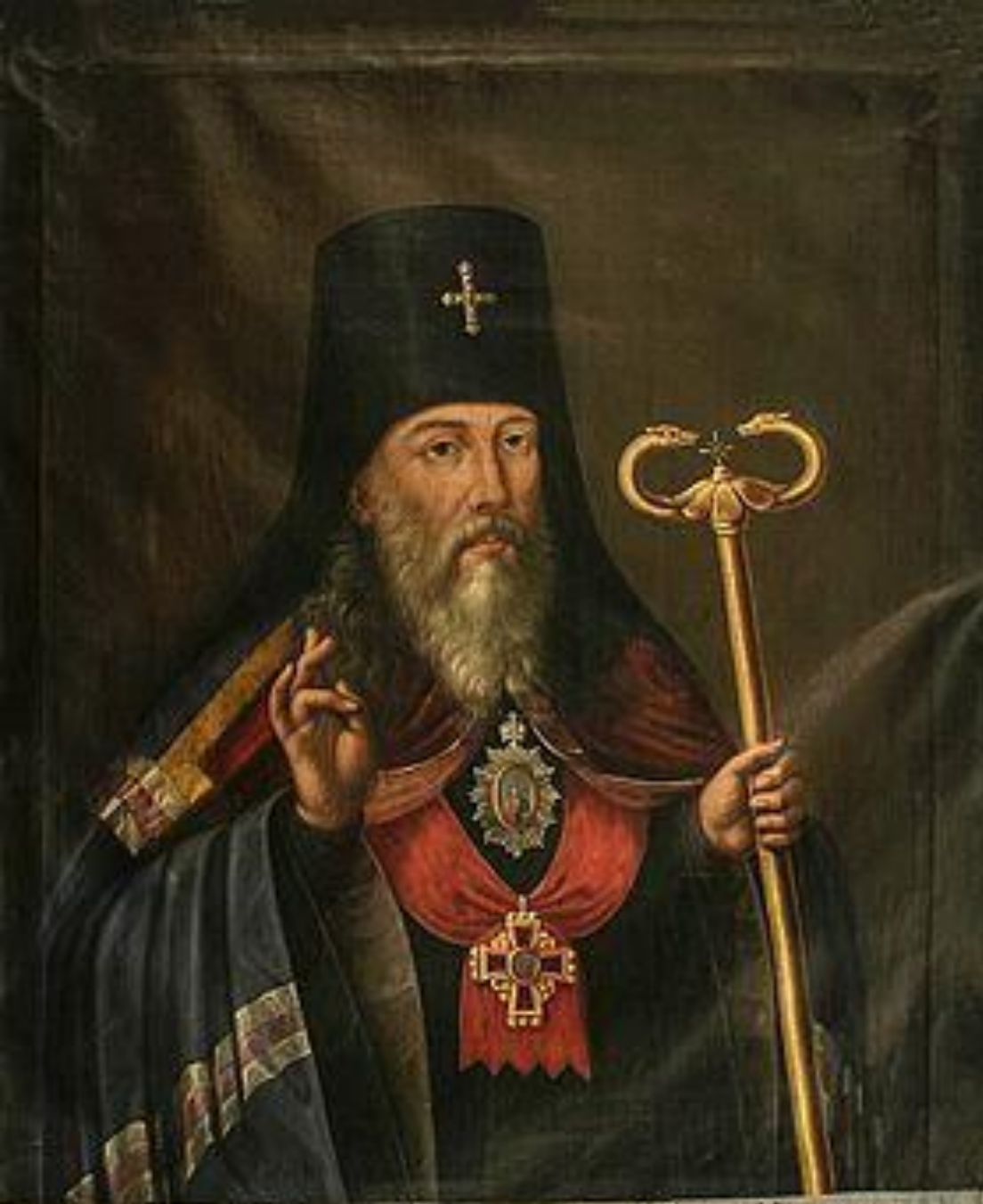
Амвросій Кедембетъ, архіеп. тобольскій, 1823