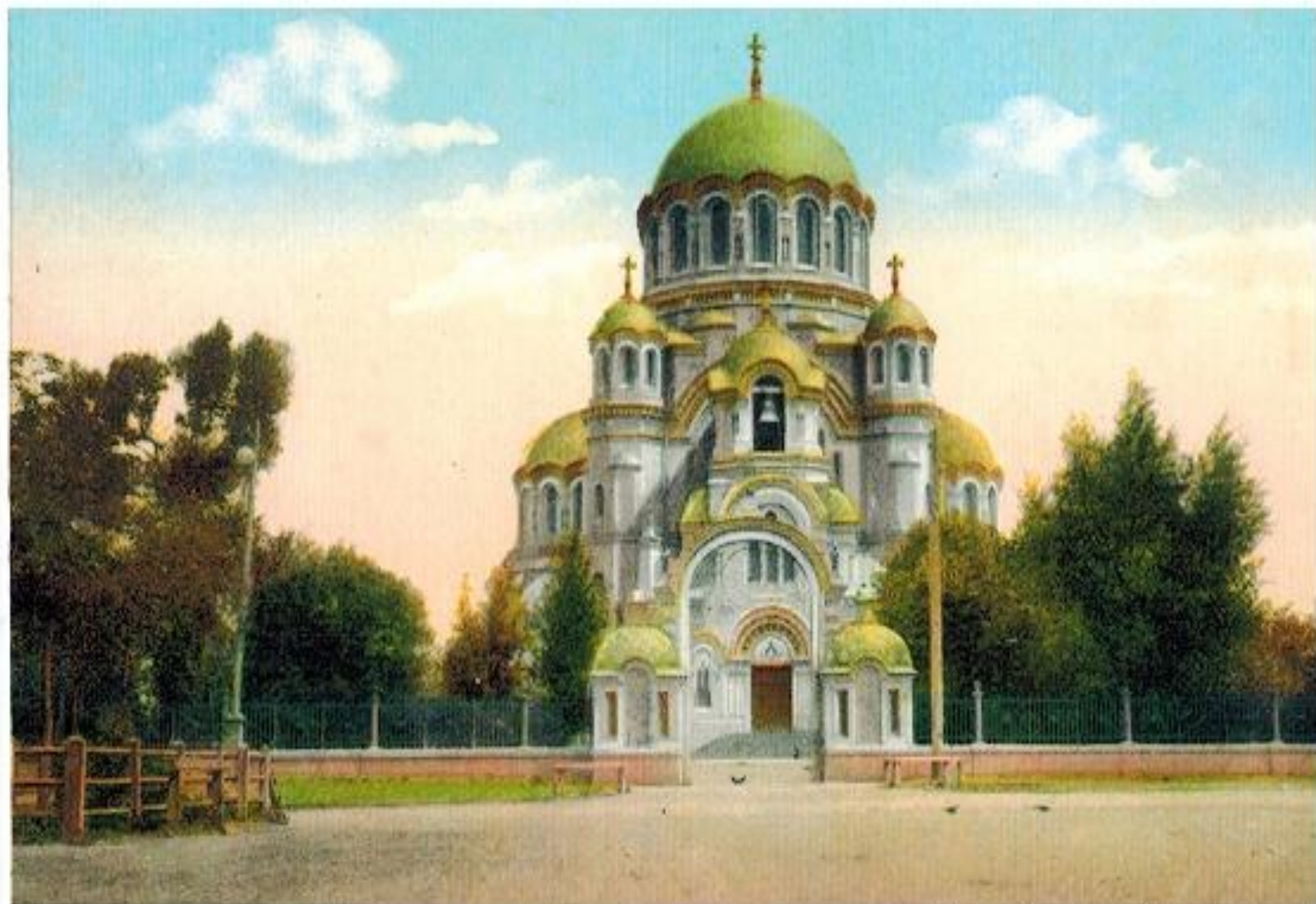
Оренбургъ. Orenburg. Казанскій кафедральный соборъ.