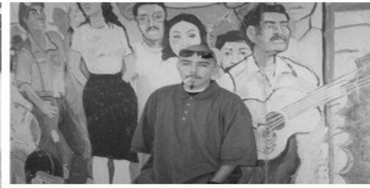
Trakeyros (top) and Chicanos (bottom).