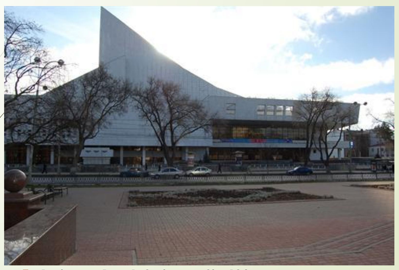
Rostov-on-Don, B. Sadovaya Str., 134