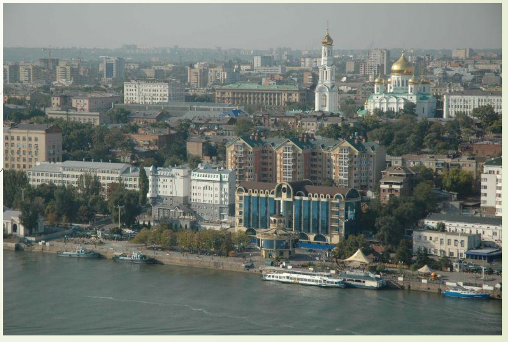
The population is over one million people.