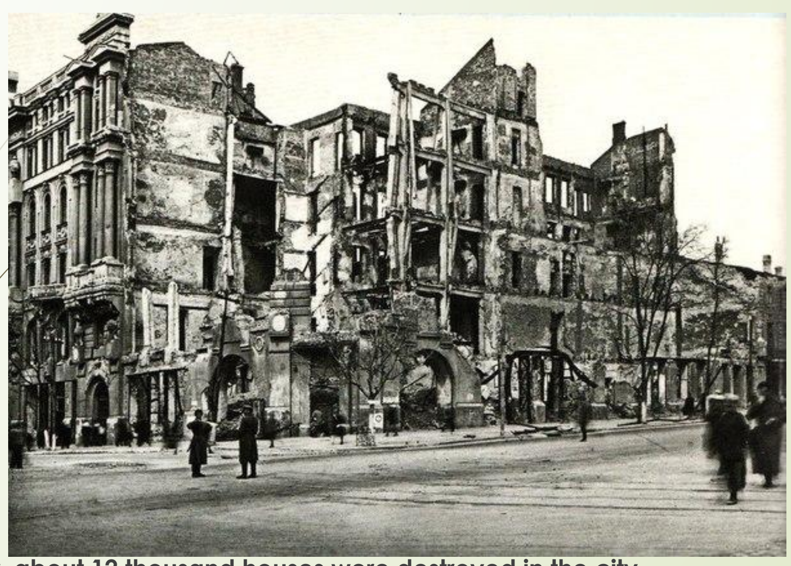
During the war, about 12 thousand houses were destroyed in the city.