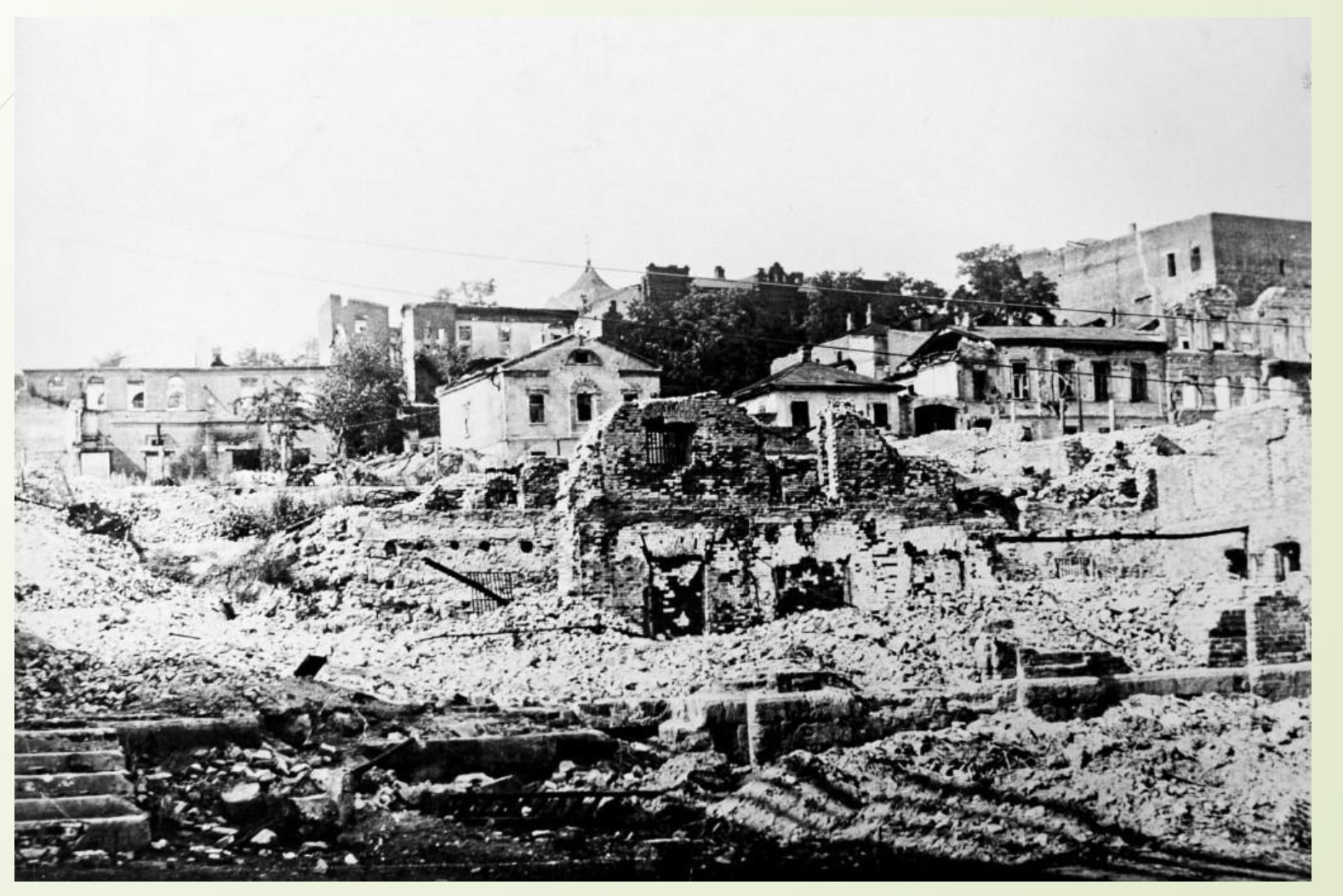
Rostov after liberation. View of the ruined city from the embankment of the Don. 1943