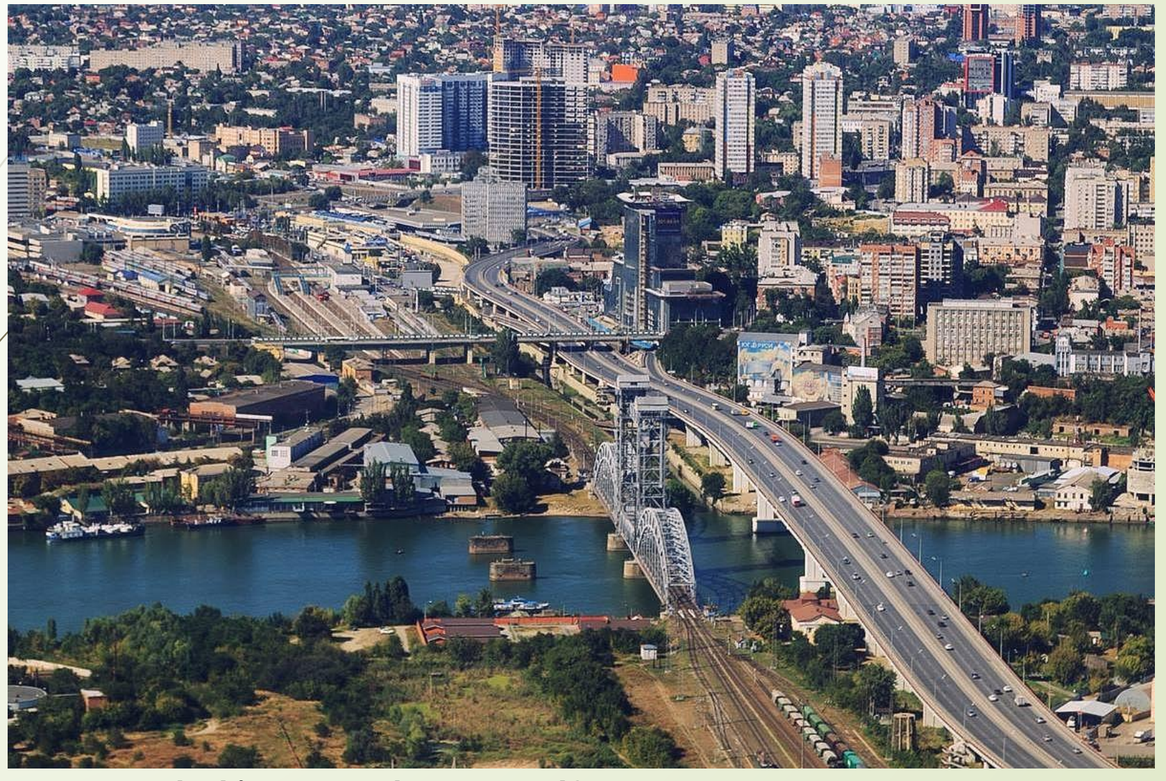
Founded in December 15, 1749.