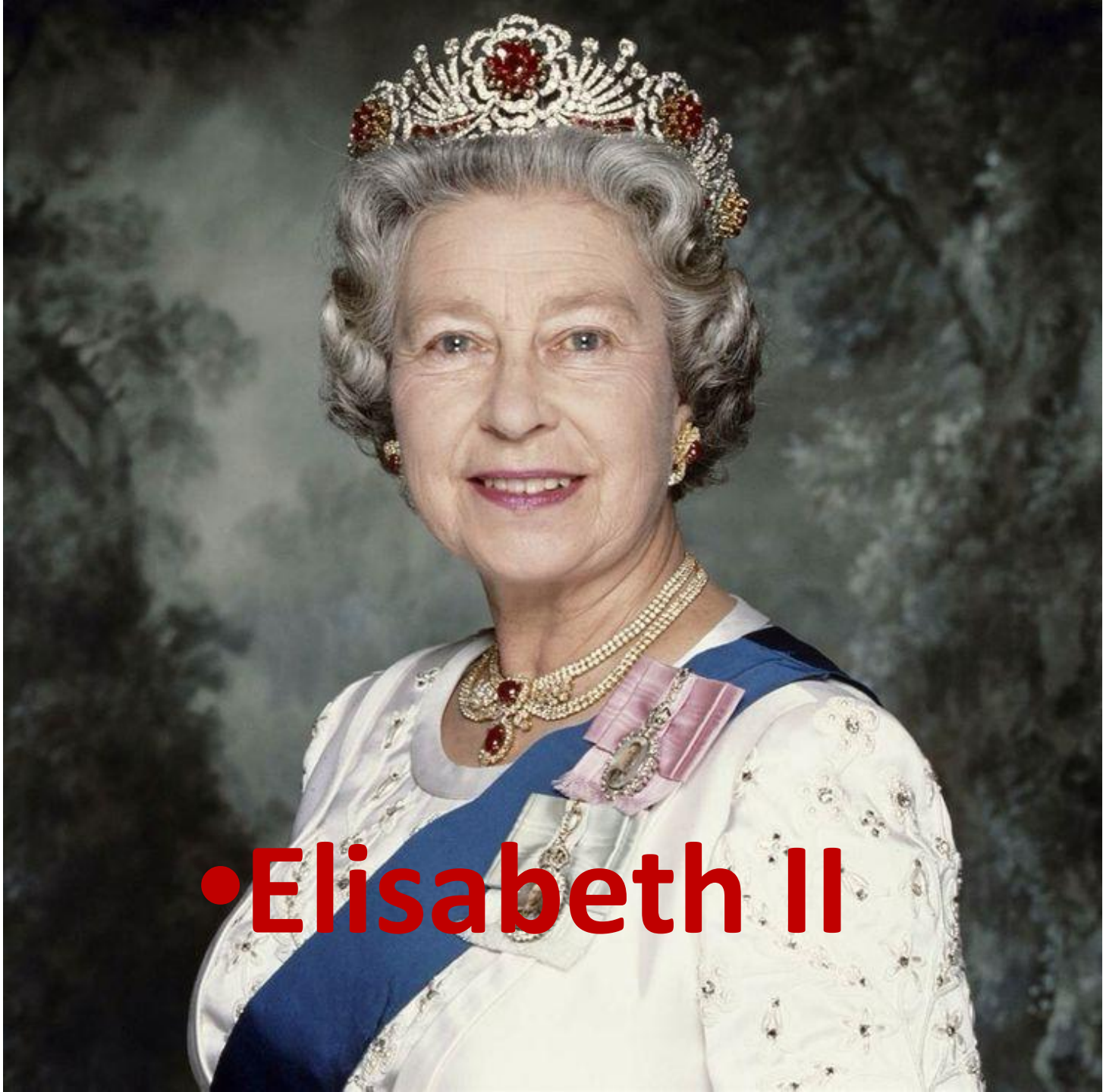
• Elisabeth II