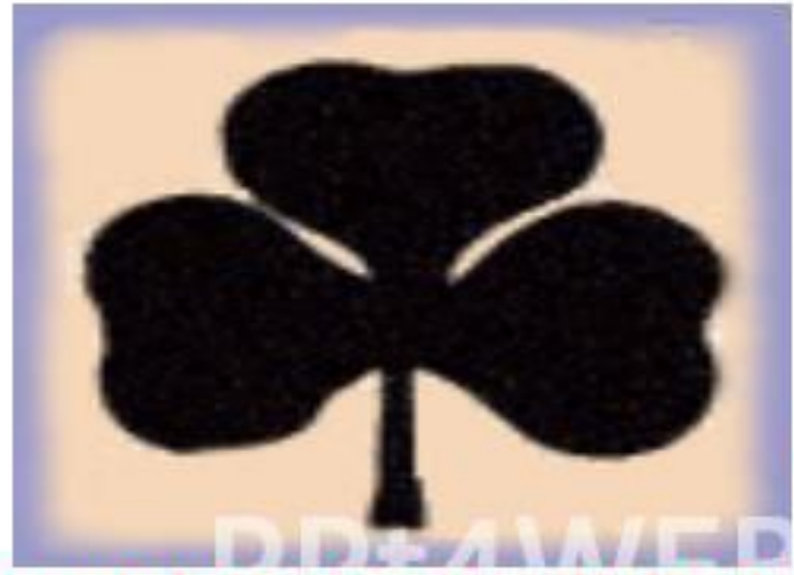
The symbol of Northern Ireland is the shamrock