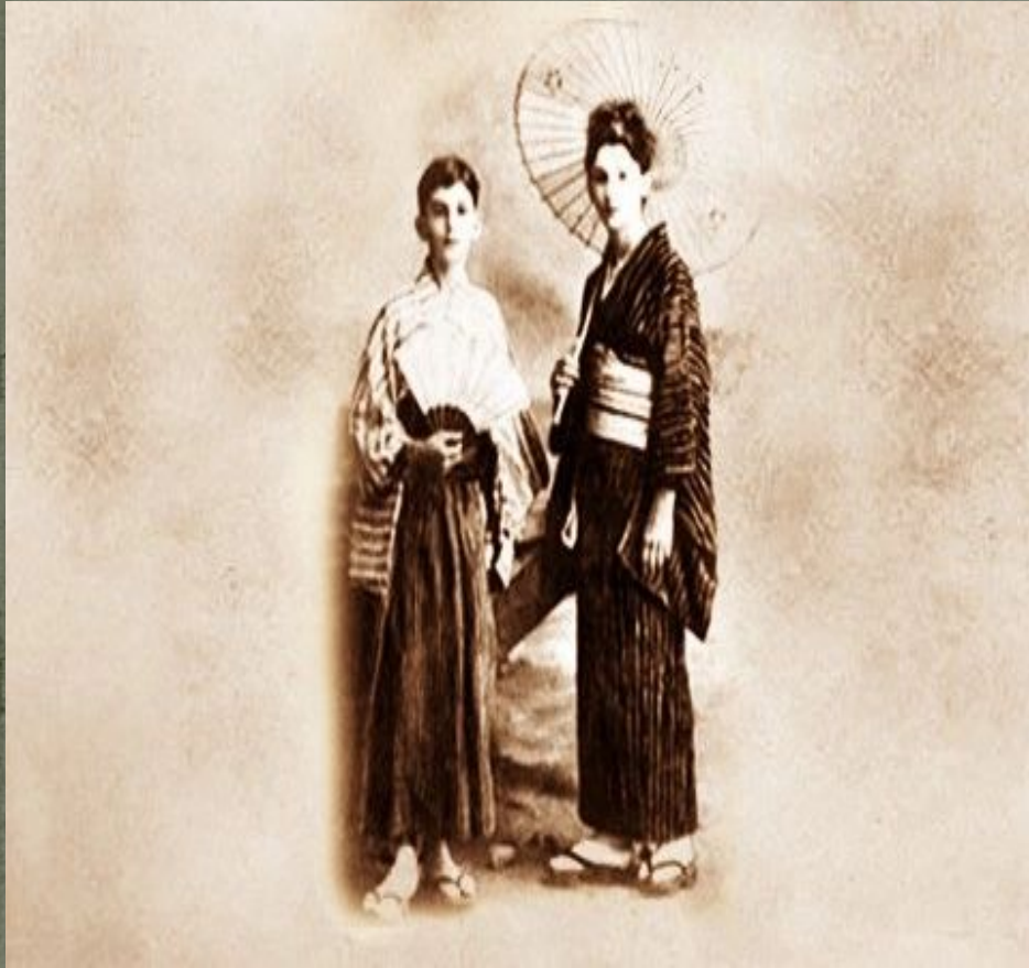
JRD and His Wife Thelma Vicaji