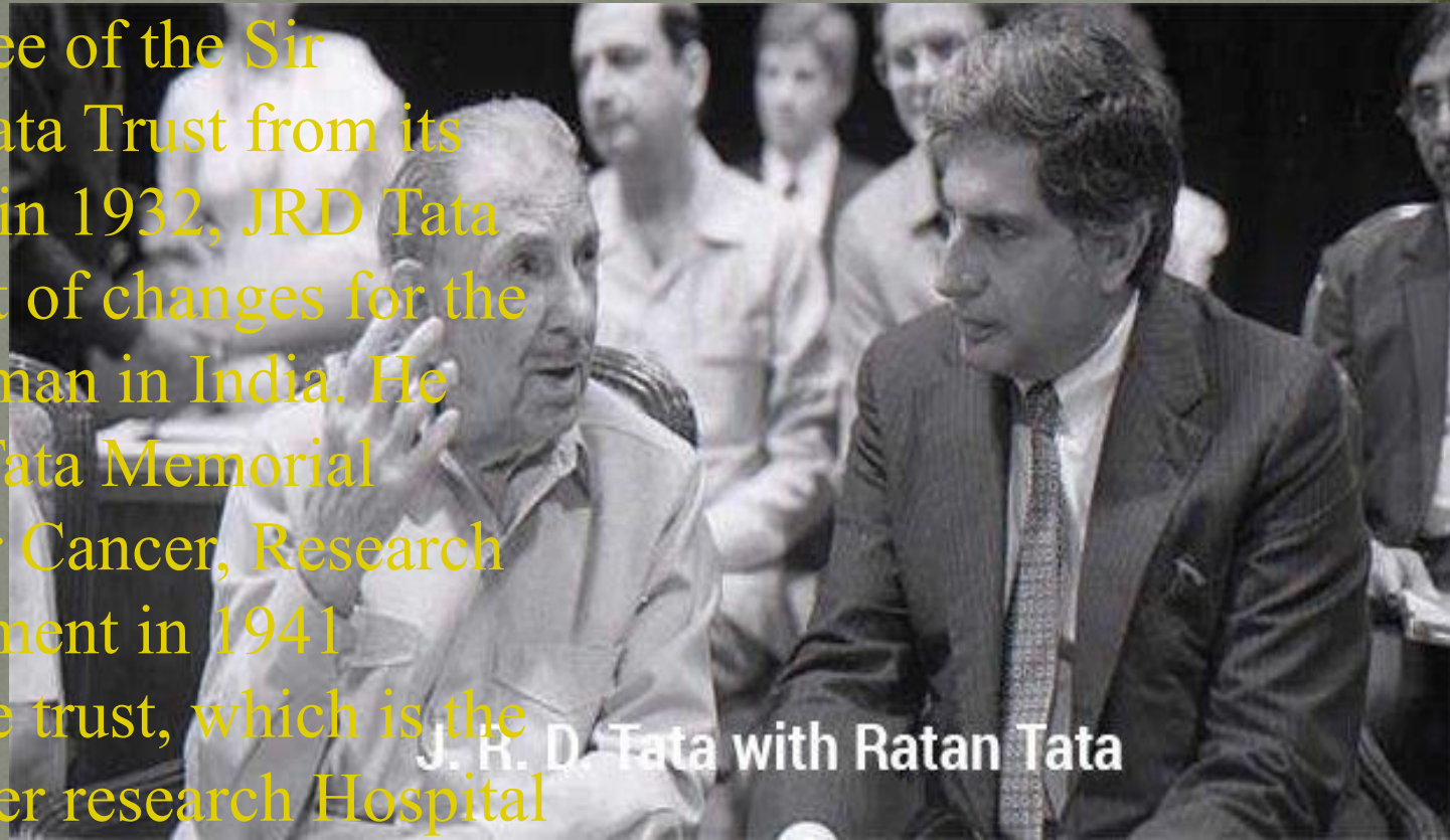
J. R. D. Tata with Ratan Tata