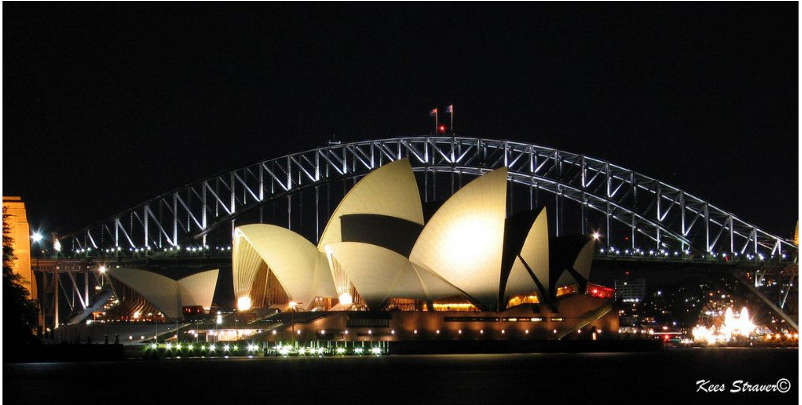
SYDNEY OPERA HOUSE