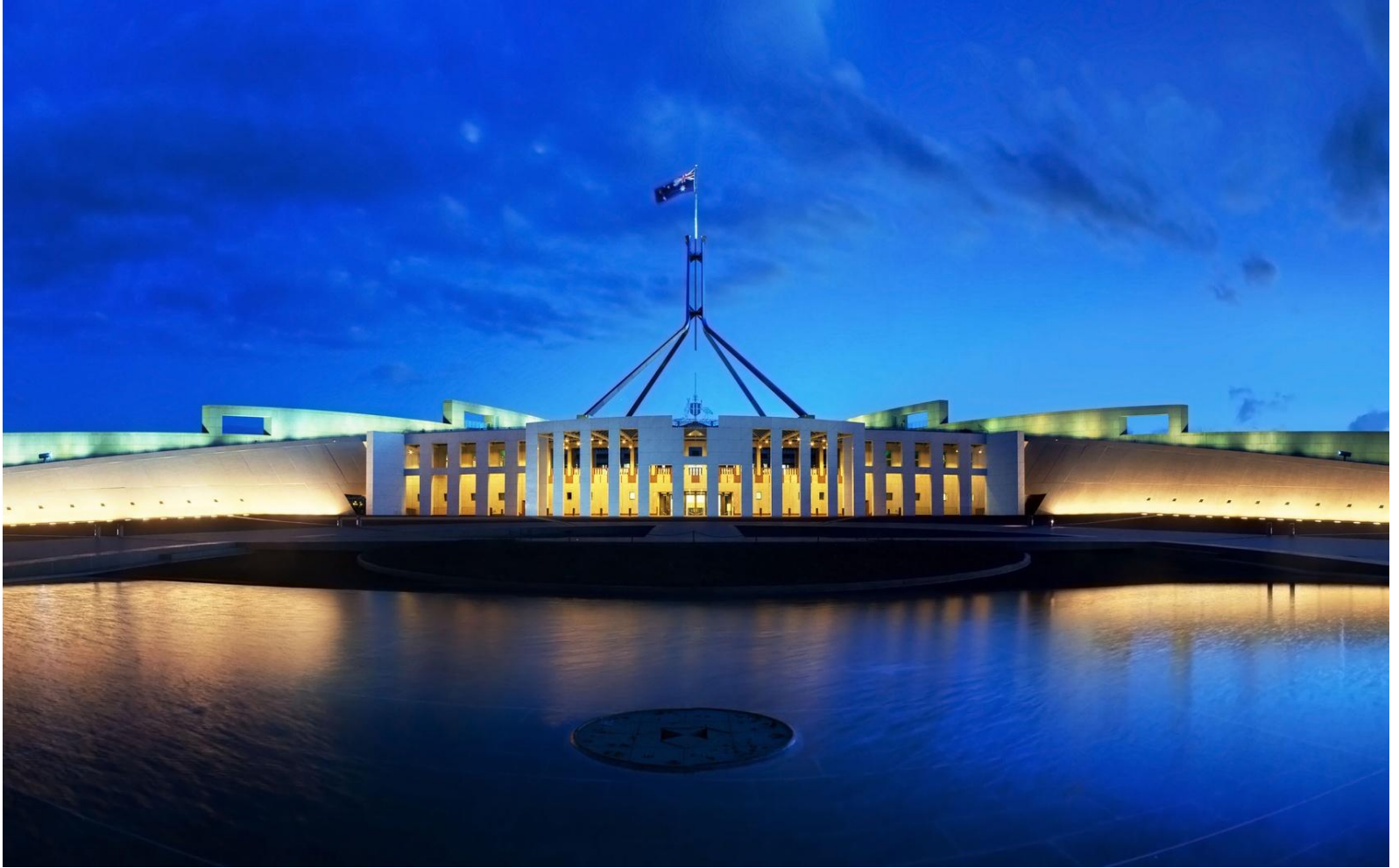
PARLIAMENT HOUSE CANBERRA