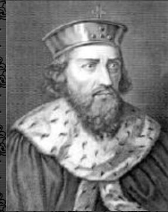
Aethelbald(2 nd son)