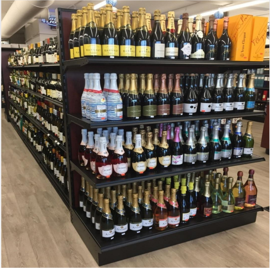
Alcohol/Wine Shop - Off-lisence