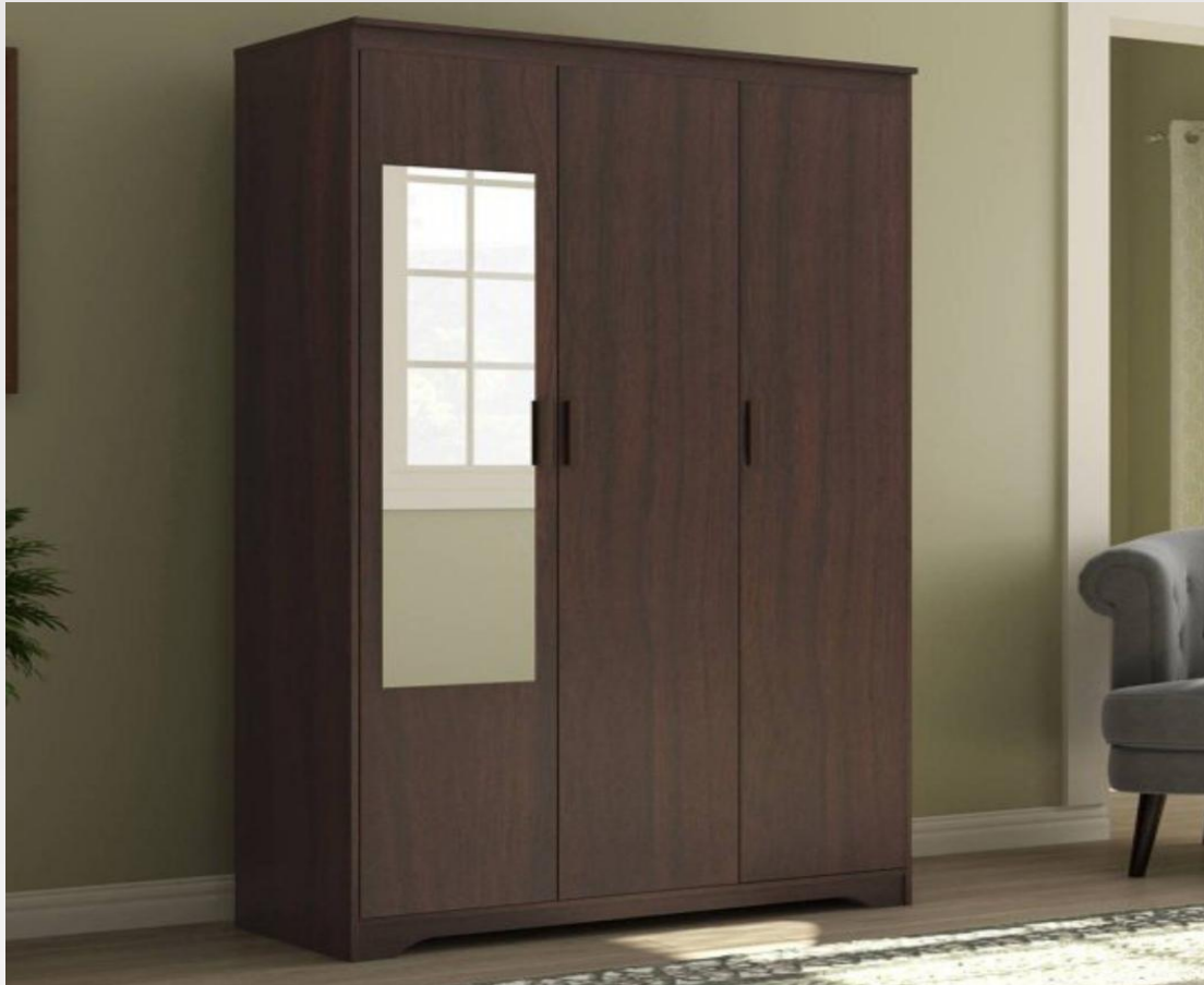
Almirah/Cupboard - Cupboard