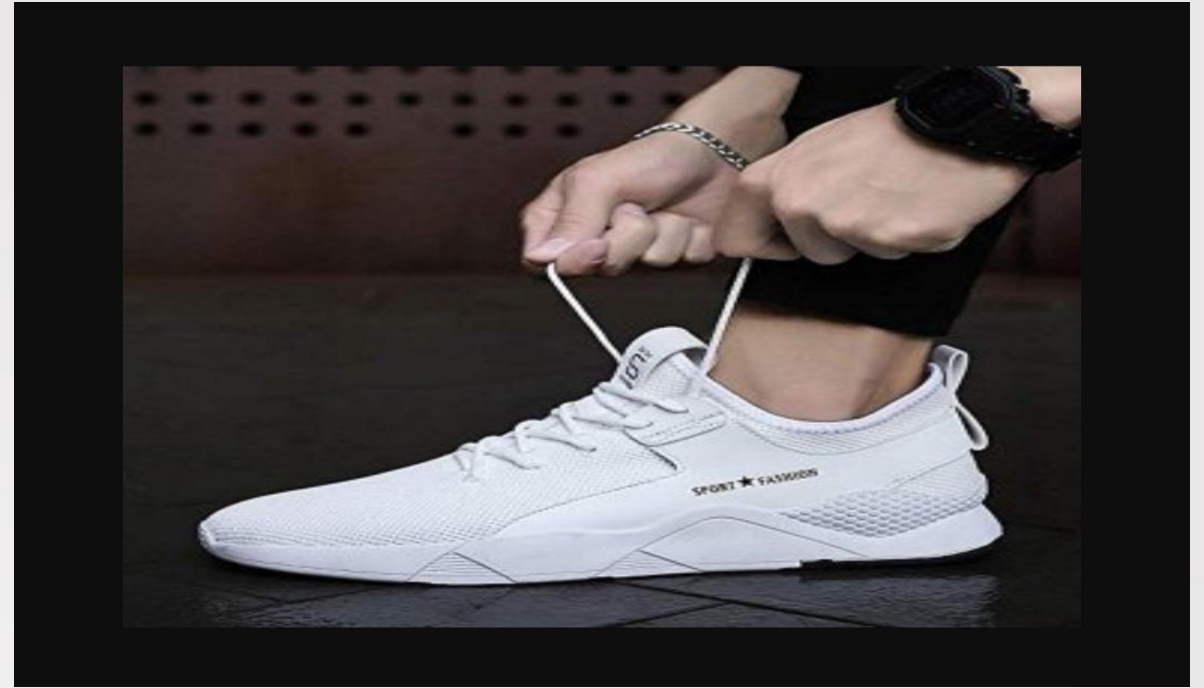
Sports shoes - Trainers