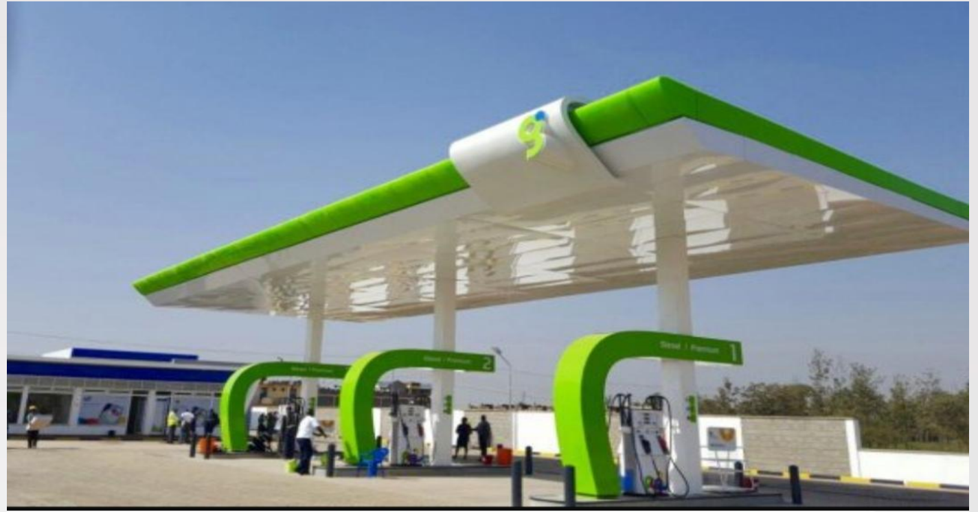
Petrol Bunk - Petrol Station