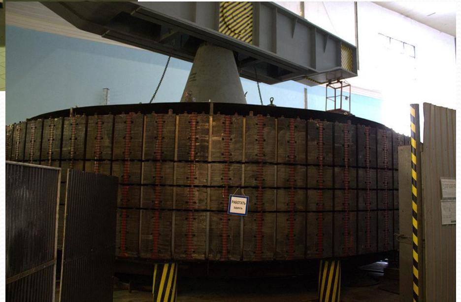
1956 – the two first power units commissioned at the Irkutsk hydroelectric