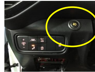
[ Button Module ]