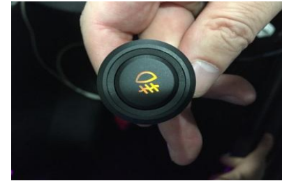
[ Button Module ]