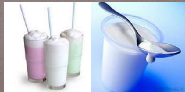
cocktail = yoghurt