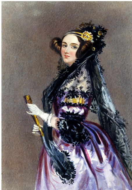
Ada Augusta Lovelace

The first program for the analytical machine was written back in 1843 by the daughter of George Byron, the Countess Ada Augusta Lovelace, and the first programmable computer was launched in 1941. It was launched (and at the same time the first programming language was invented) by German engineer Konrad Zuse.