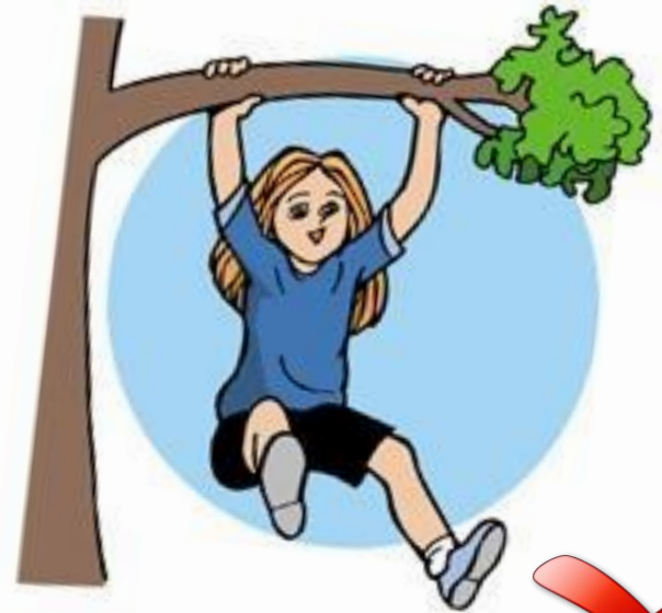
climb a tree