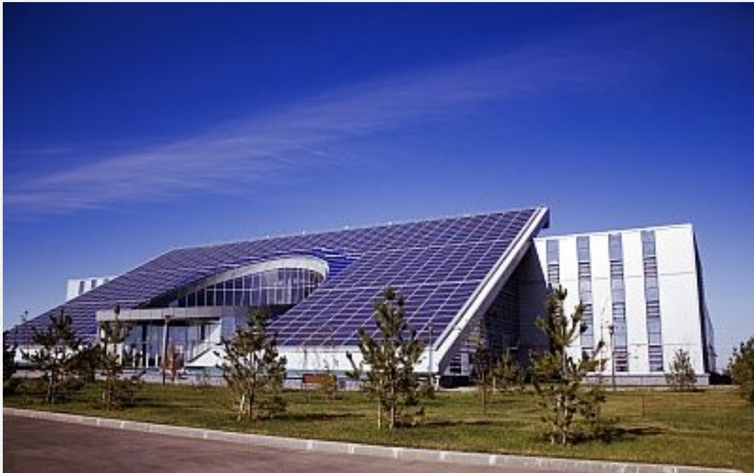
“Astana Solar” LLP