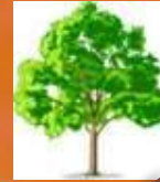
My friend's house