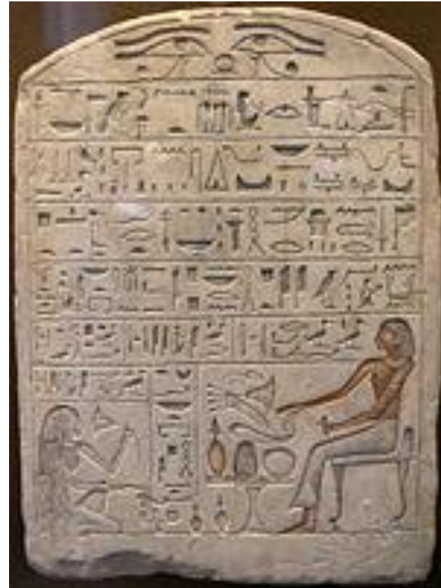
Limestone stele of a chief potter, 18th century BC