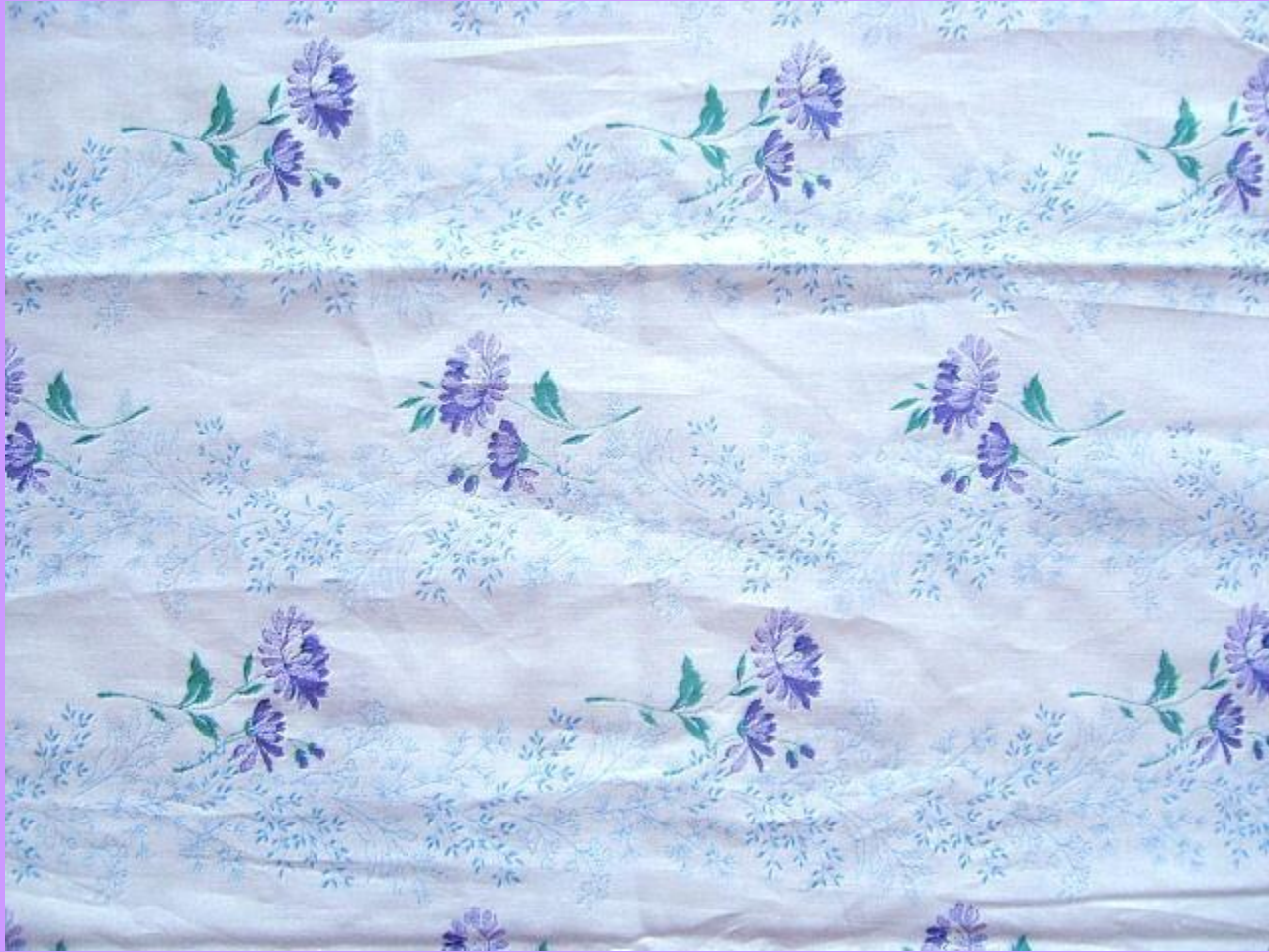
Printed cotton, calico