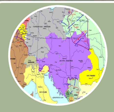
The main reason in that, the leading empire sought to world repartition.