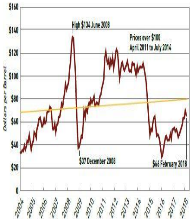
ALASKA CRUDE OIL PRICES 2004-2018

In 2018, the estimated population of Alaska is 738,068. The last nationwide census in the United States was carried out in 2010 , when the population of Alaska was officially counted at 710,231 people. That figure represented a growth in population of 13.3% from the year 2000.