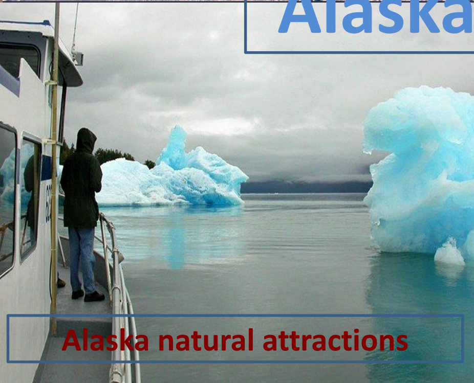
Alaska natural attractions