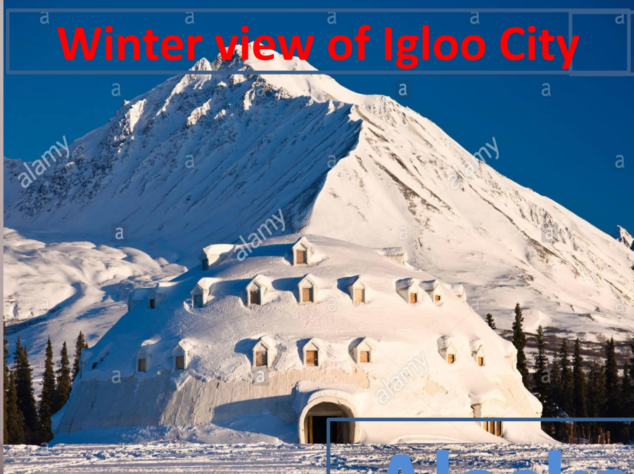
Winter view of Igloo City