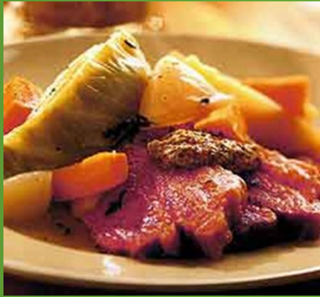
BACON AND CARBAGE