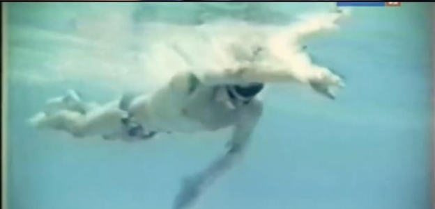
August 1997 Sevilla European Swimming Championships.

After 9 months Popov already swam 20 kilometers each day. His goal was to get to the European Championship in Spain. Popov statement about his return to the sport has becomes a sensation. But his victory few people believed in.