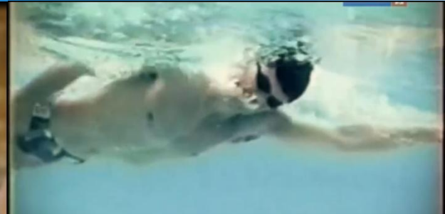
The first serious start after Alexander injured.