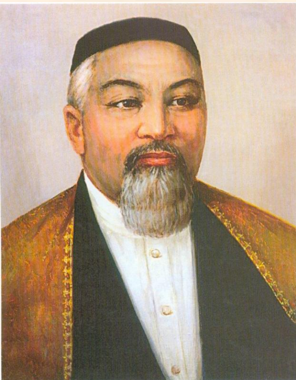
АБАЙ (ИБРАГИМ) КУНАНБАЕВ АБАЙ (ИБРАГИМ) КУНАНБАЕВ ABAY (IBRAGIM) KUNANBAEV

When a small child is born from a mother, he is born from two different personalities. Someone wants to drink, eat and sleep. One would like to know one. What he saw prompted him to ask: "What is this?", "What is this?" and "Why did he accumulate?", "Why did he peck?" He asks for everything that he heard and heard, and finds no peace. All this means that I want to know, I see, I teach.