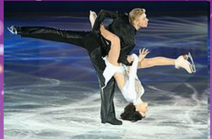
Figure skating is an Olympic sport in which individuals, pairs, or groups perform spins, jumps, footwork and other intricate and challenging moves on ice skates.