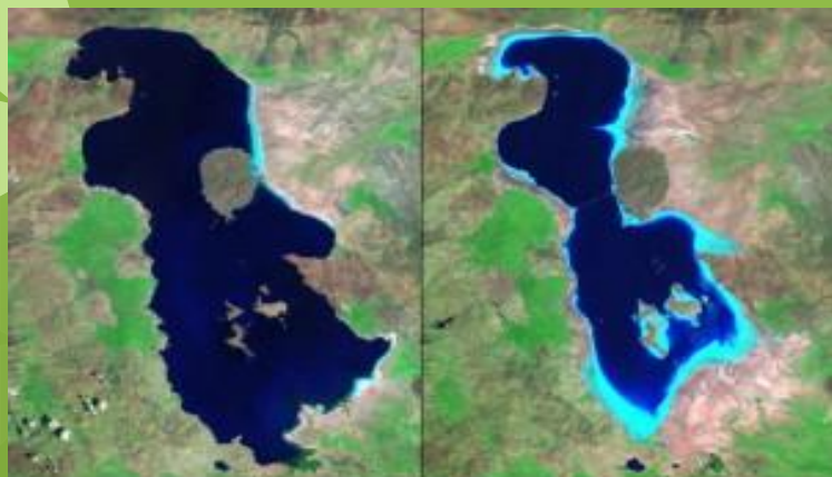
Lake Urmia. Left: 1985. Right: August 2010.

Vast forests are cut and burn in fire. Their disappearance upsets the oxygen balance. As a result some rare species of animals, birds, fish and plants disappear forever, a number of rivers and lakes dry up.