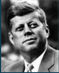
John F. Kennedy