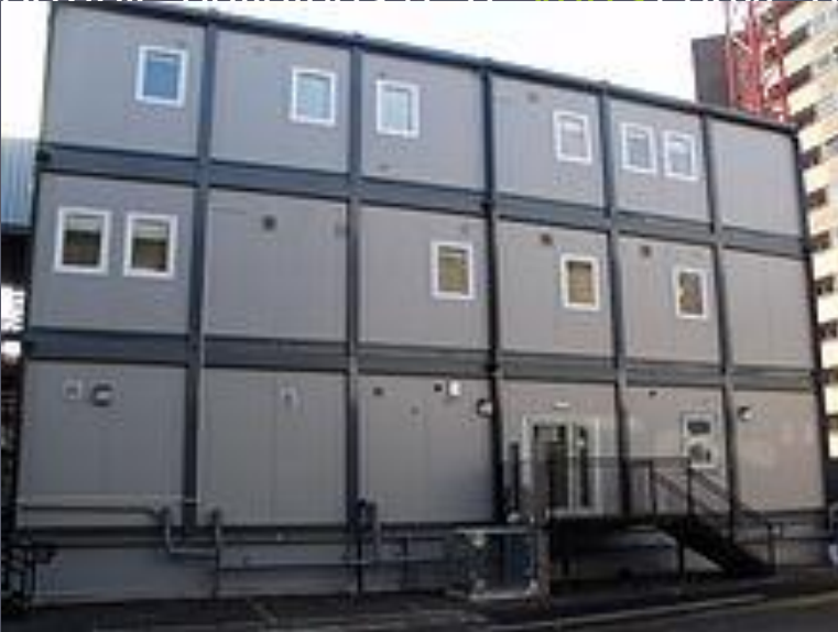
New Street Station New Street Station, Birmingham

A portable , demountable or transportable building, is a building designed and built to be movable rather than permanently located. A common modern design is sometimes called a modular building building, is a building designed and built to be movable rather than permanently located. A common modern design is sometimes called a modular building, but portable buildings can be different in that they are more often used temporarily and taken away later. Portable buildings (e.g. yurts ) have been used since prehistoric times