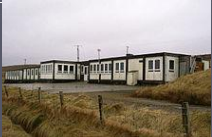
North Isles Motel in Cunnister North Isles Motel in Cunnister, Shetland