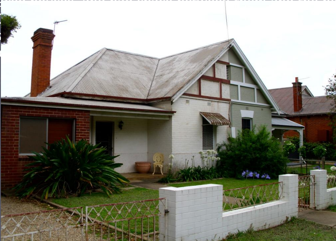
Semi- detached дом в Street Томпсон.

Detached house is a house that stands separate from its neighbouring property on all sides, thus being physically DETACHED. When modern housing estates started to be built in the 1920's they became very popular, as were marketed being far superior to terraced houses is a house that stands separate from its neighbouring property on all sides, thus being physically DETACHED. When modern housing estates started to be built in the 1920's they became very popular, as were marketed being far superior to terraced houses – and had space between them and the neighbour on both sides. Of course, detached houses are more expensive than terraced houses. Detached house