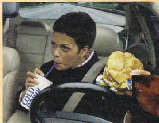
2 drive-through service