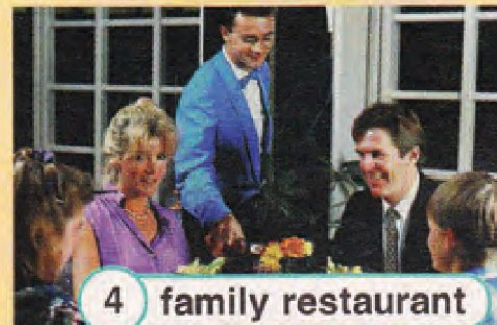
4 family restaurant