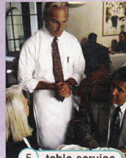
5 table service