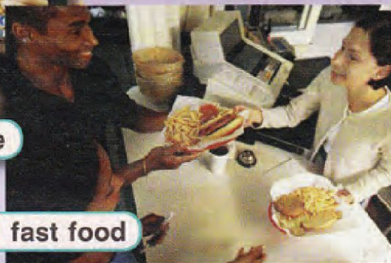
3 fast food