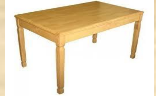
It is a table.