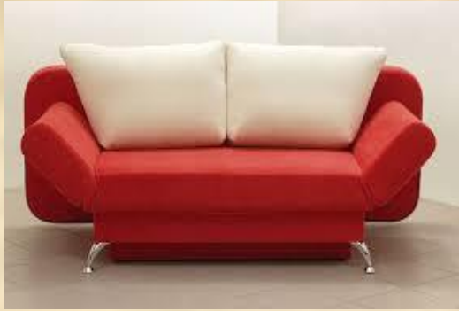
It is a sofa.