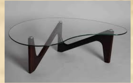
a coffee table