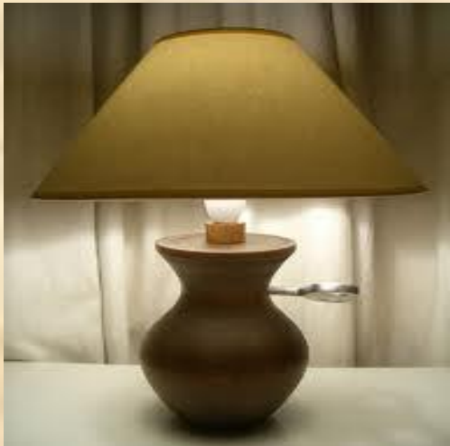
It is a lamp.