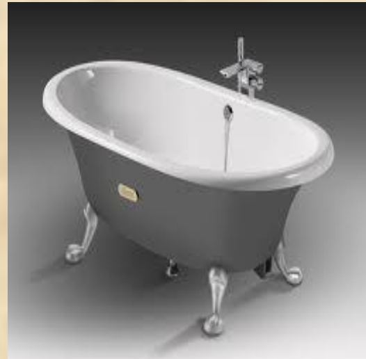
It is a bath.