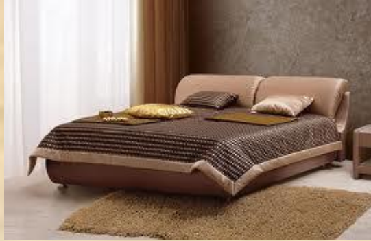
It is a bed.