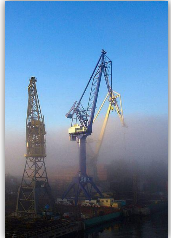
The Saint Petersburg docks at dawn