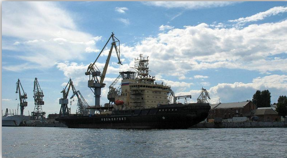
Icebreaker Moscow during the final stage of construction on the Baltic Shipyard