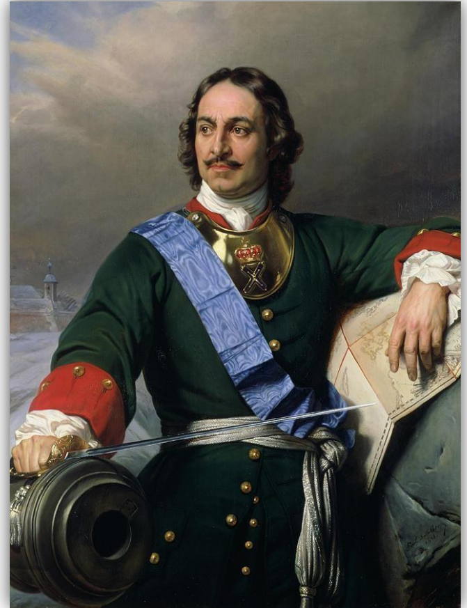
Peter the Great

Between 1713-1728 and 1732-1918, Saint Petersburg was the imperial capital of Russia.