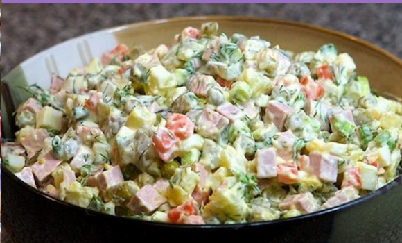
Russian Salad and Champagne.