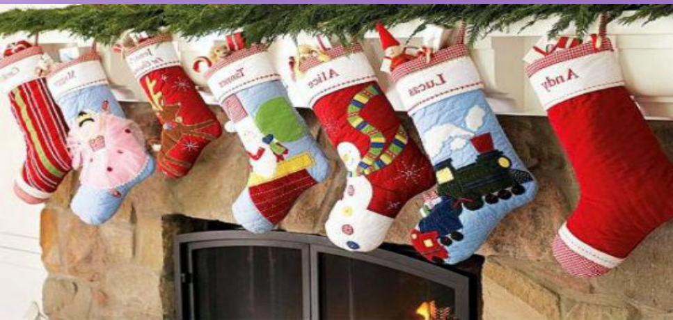
Socks with presents in the fire-place.

Symbols and attributes in France are either like in Russia. On the New Year's table are salads, meat, sweets, fruits, vine, champagne and baking. Santa Claus is the Grandfather Frost in France. The children hang socks for presents to a fire-place.