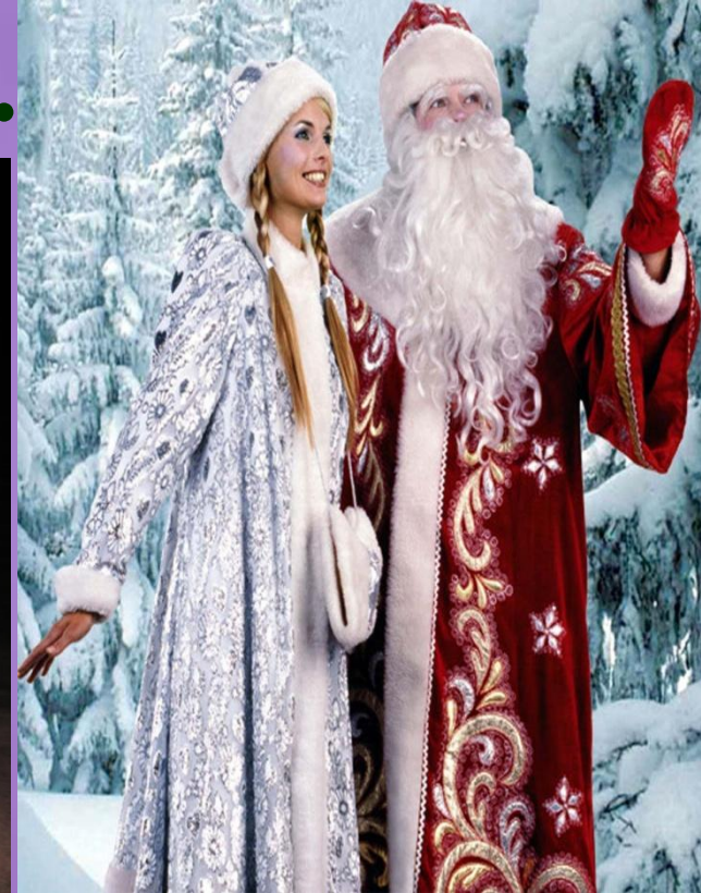
Grandfather Frost and Snow-Maiden.