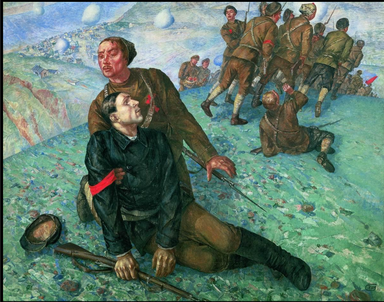
Petrov-Vodkin. Death commissioner

The Russian Museum houses a collection of Soviet paintings.