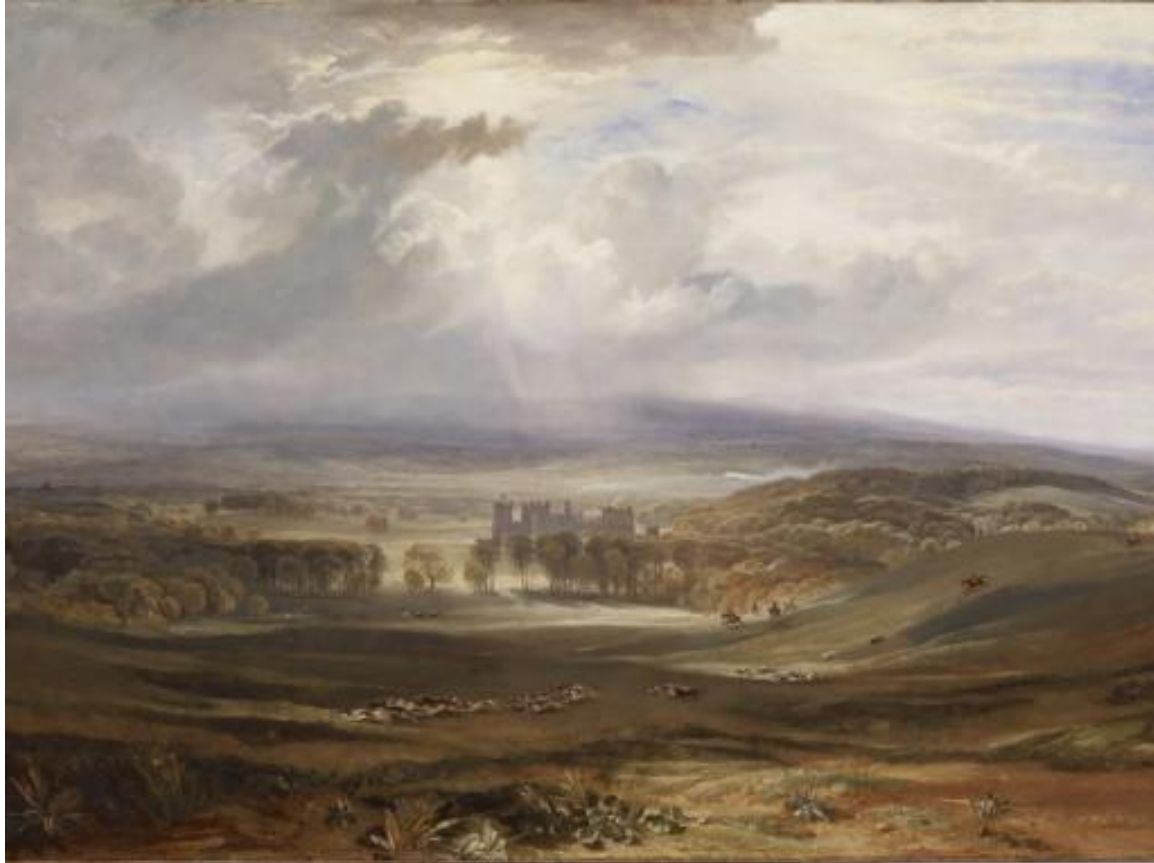
Raby Castle (1817)