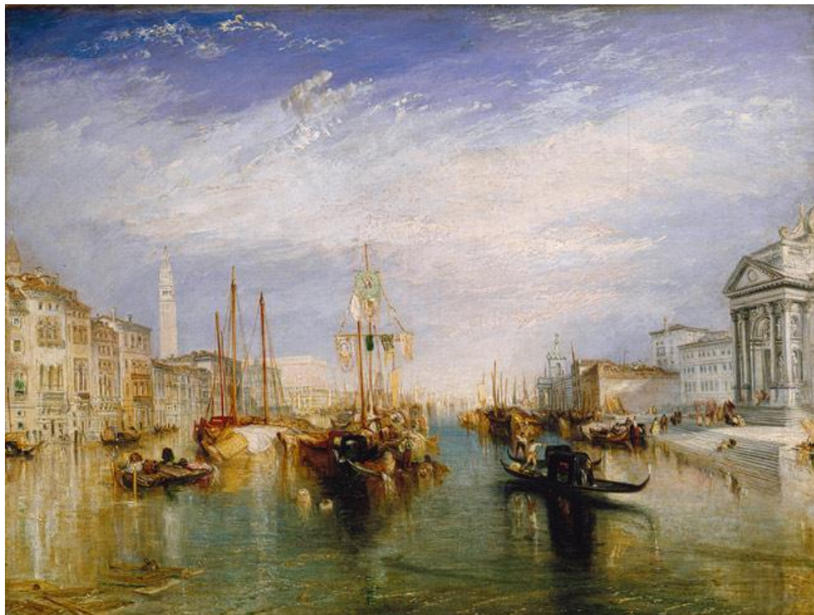
Venice, from the Porch of Madonna della Salute (1835)