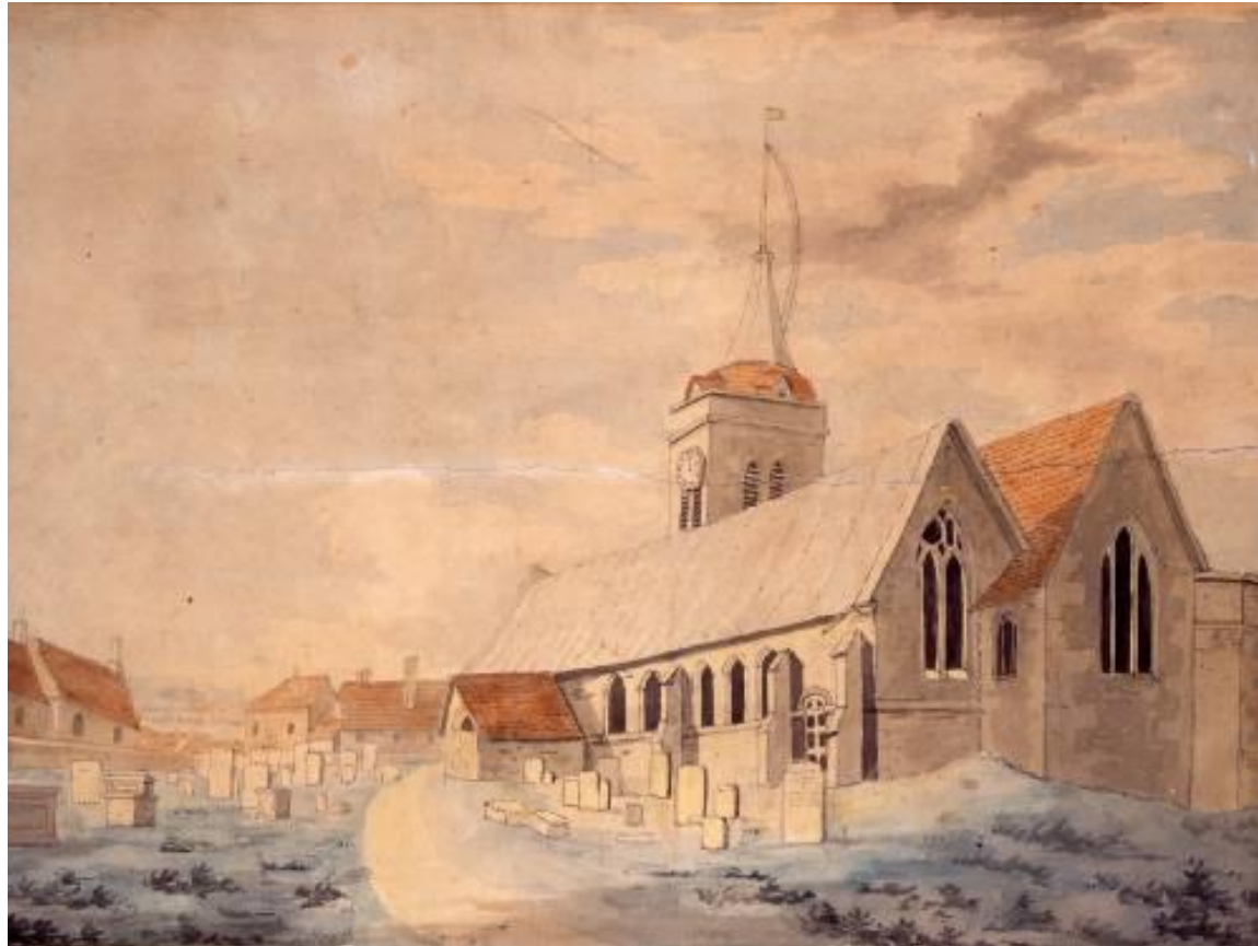
St John's Church Margate (1784)