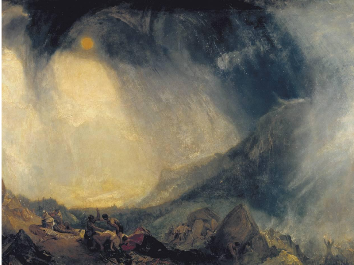
Snow Storm (1812)