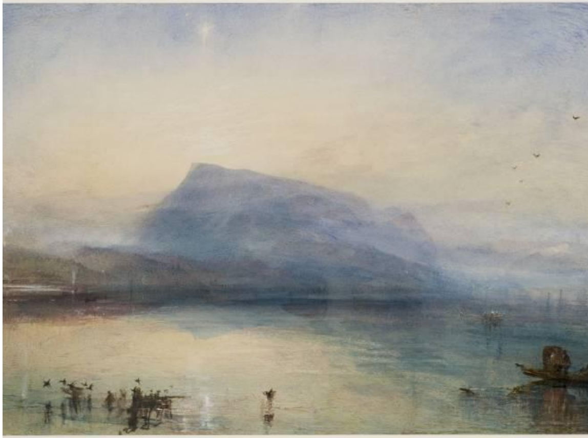
The Blue Rigi (1842)