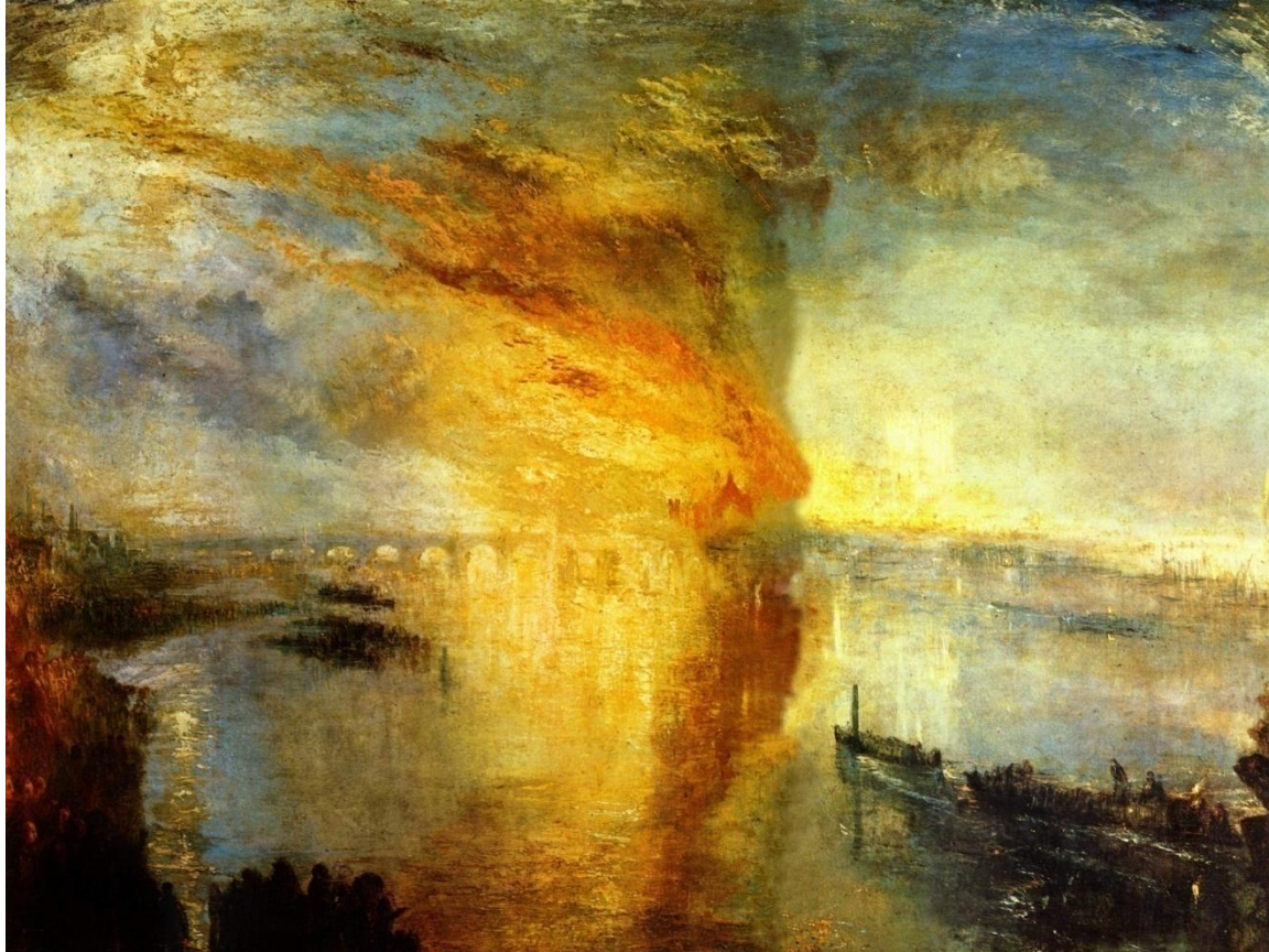
The Burning of the House of Lords and Commons (1835)