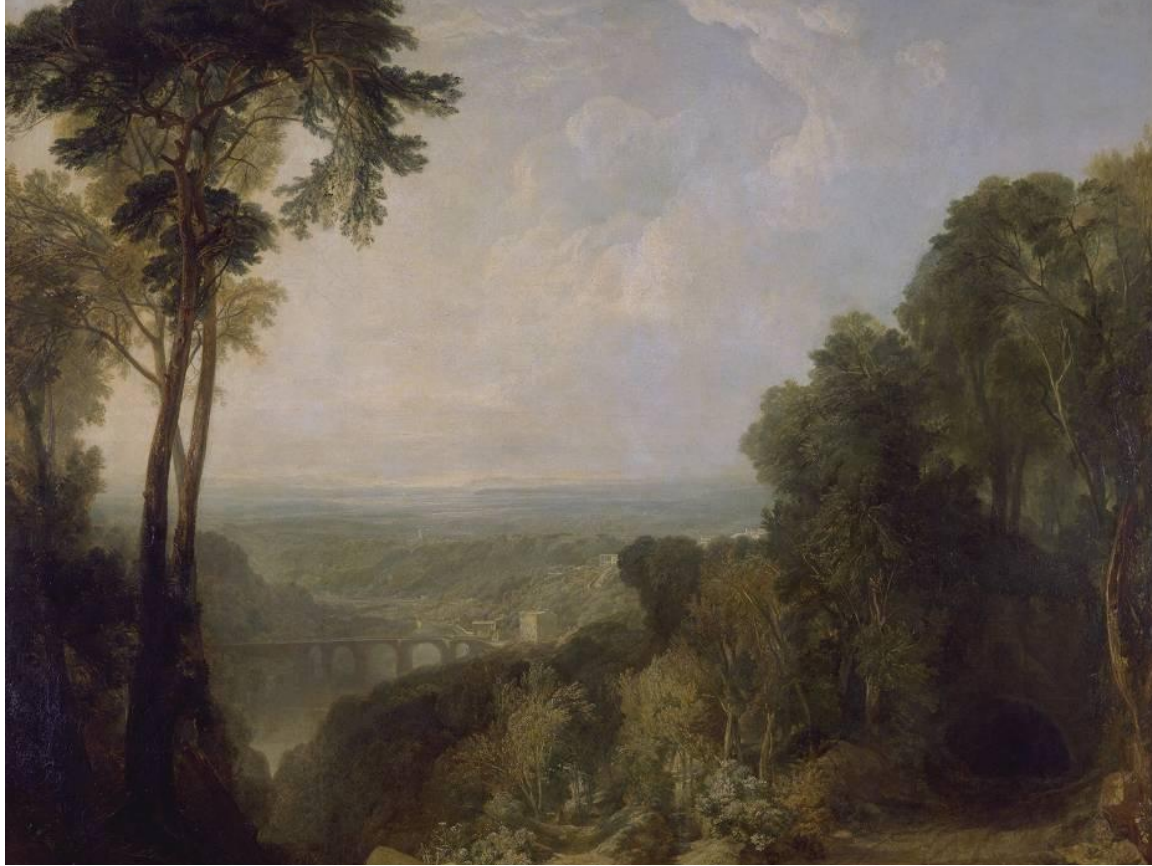
Crossing the Brook (1815)