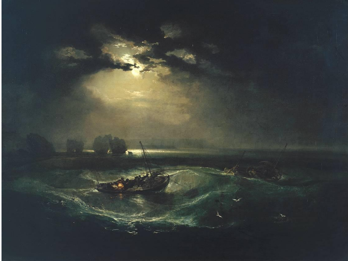
The Fishermen at the Sea (1796)