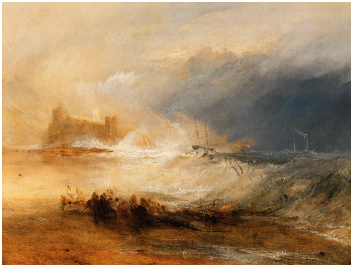
Wreckers -Coast of Northumberland, with a Steam-Boat Assisting a Ship off a Shore (1833-1834)