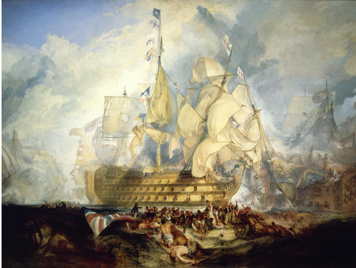
The Battle of Trafalgar (1822)