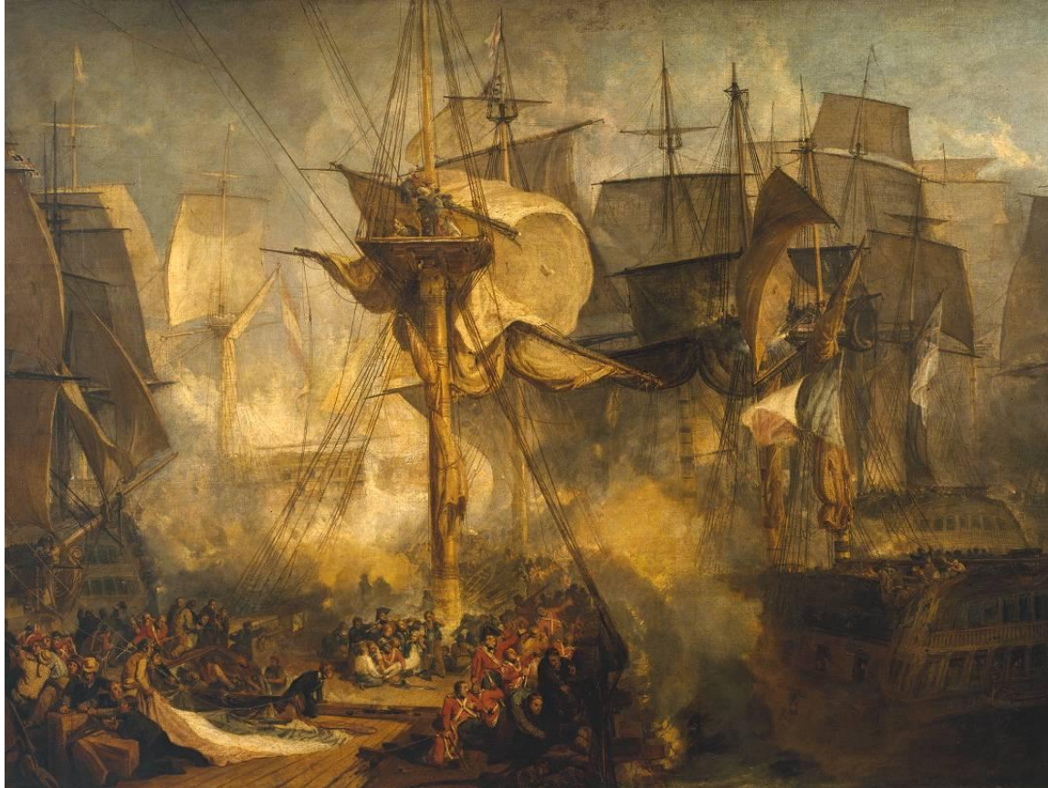
The Battle of Trafalgar (1806)