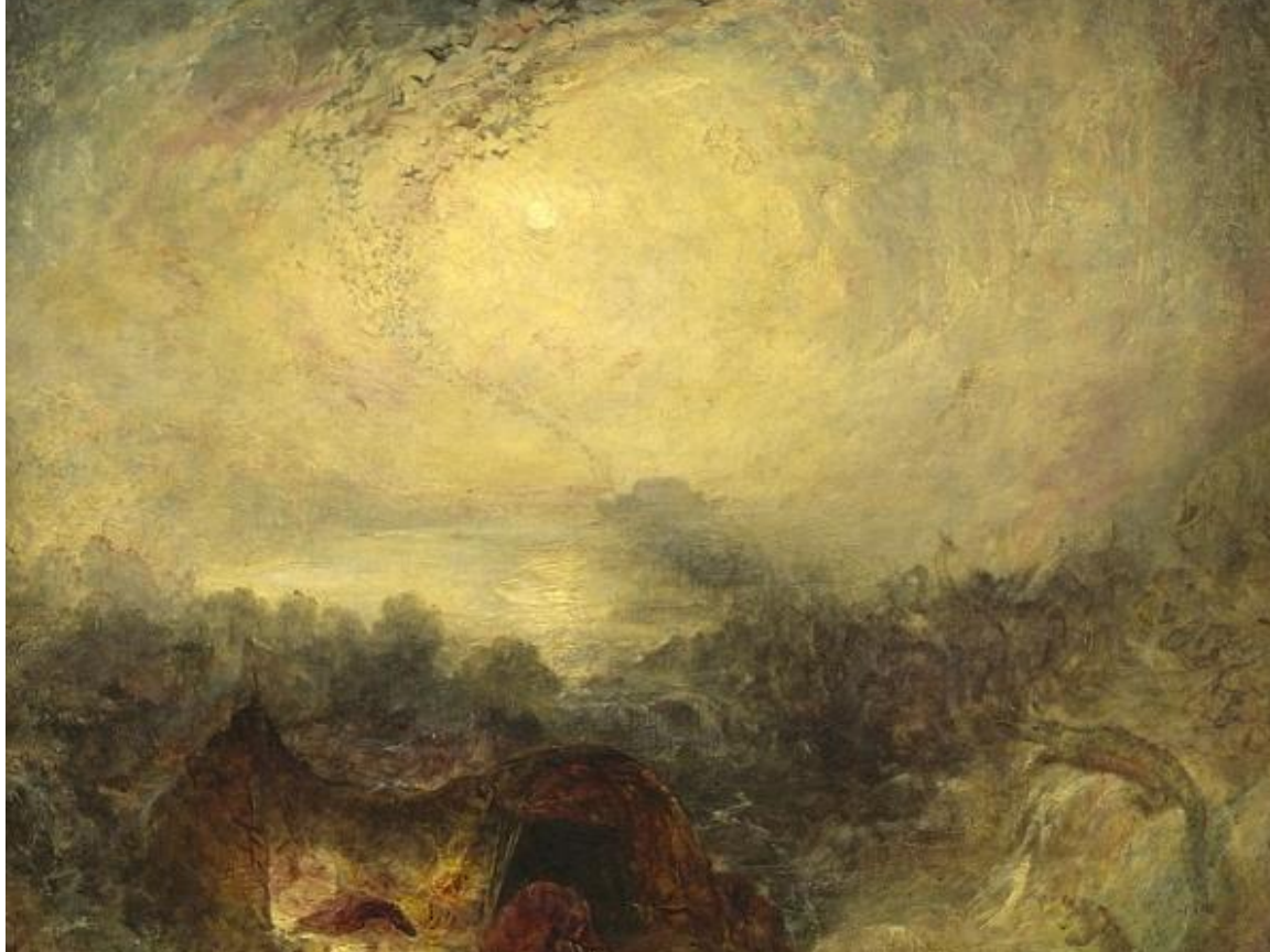
The Evening of the Deluge (1843)