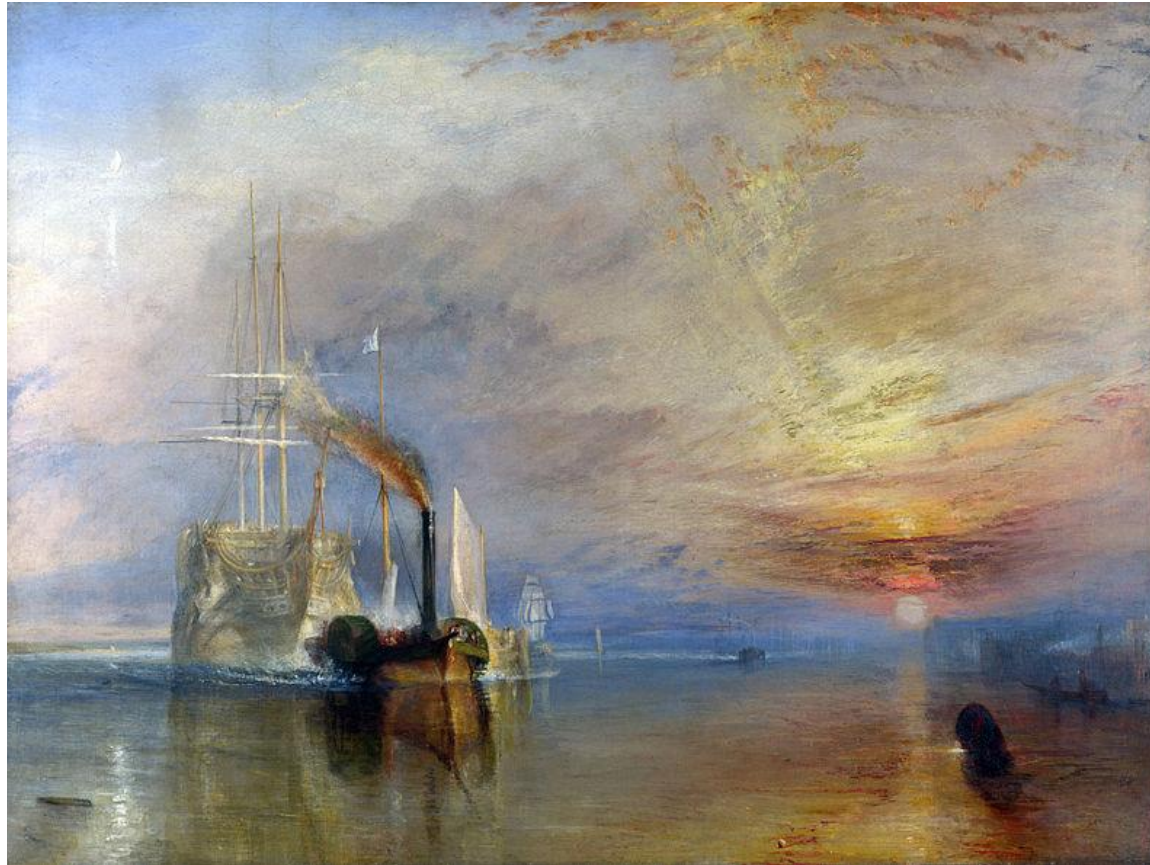
The Fighting Téméraire tugged to her last Berth to be broken (1838)