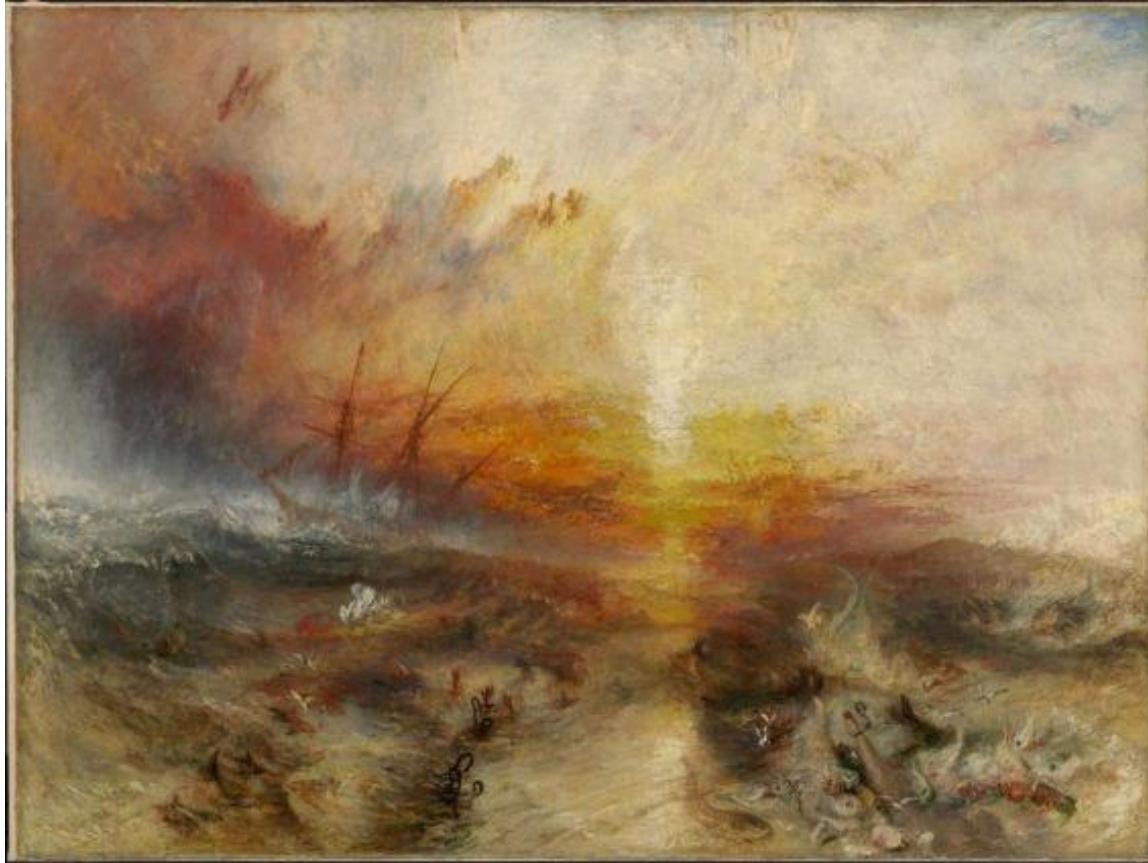
Slave Ship (1840)