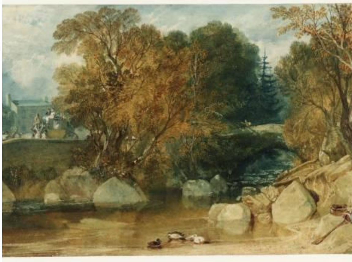
Ivy Bridge, Devonshire