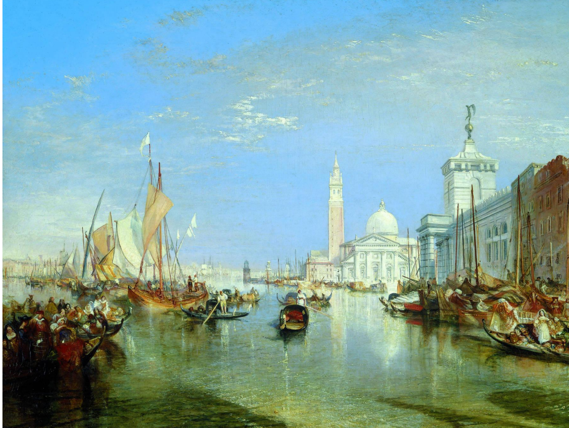
Venice: The Dogana and San Giorgio Maggiore (1834)