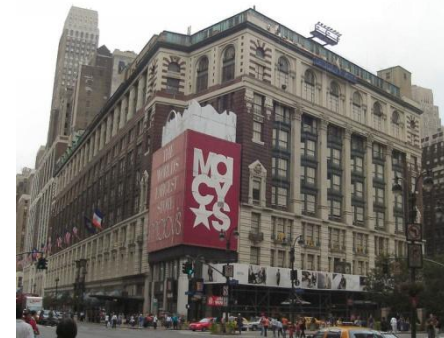
The Macy's department store in New York City

Department store is a large shop with many departments for different kinds of goods.