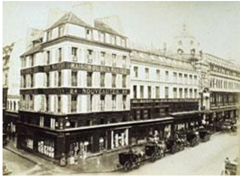
Le Bon Marché department store in Paris, 1867