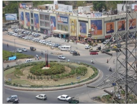
Big Bazaar at Ahmedabad, India.