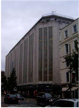
Kendals department store in Manchester, England.