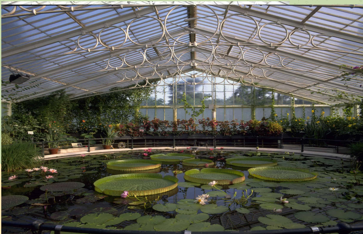
Water Lily House