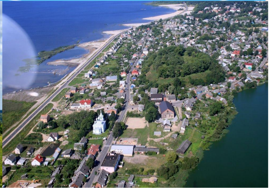
BRASLAV IS A SMALL DISTRICT TOWN