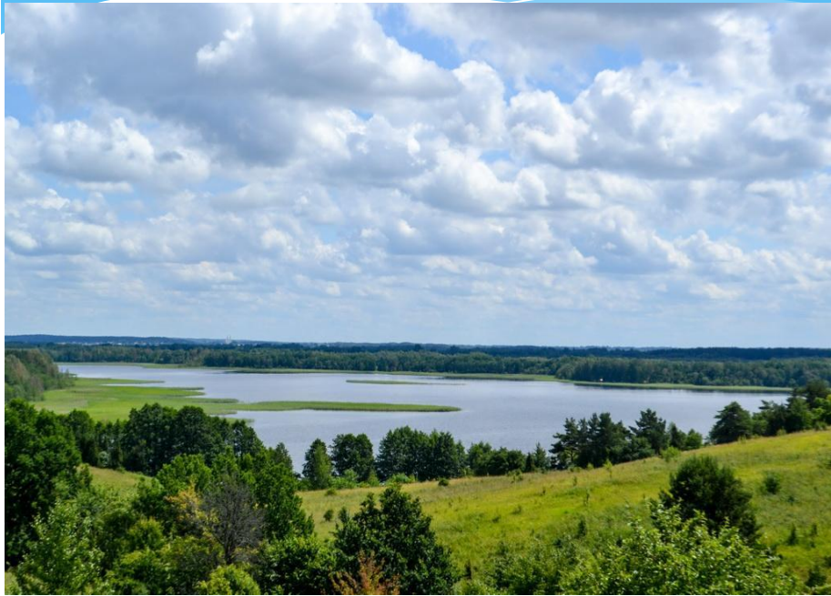
LANDSCAPE OF BRASLAV LAKES