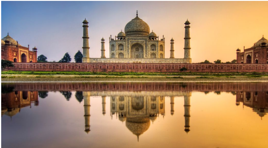
T A J M A H A L