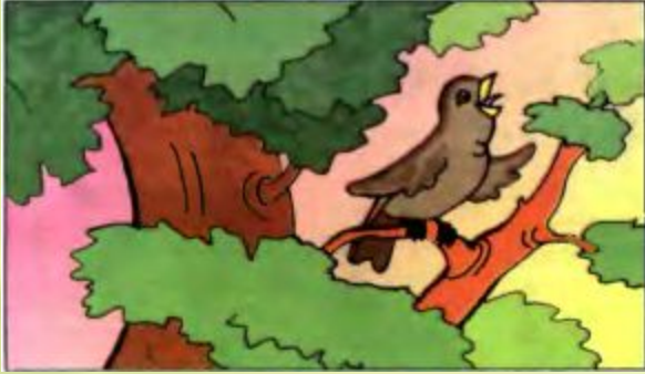
In the tree