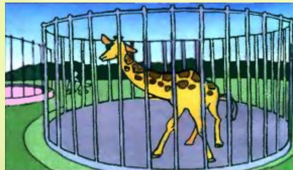
In the zoo