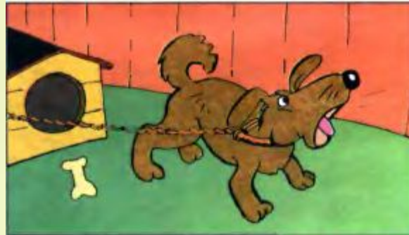
In the yard