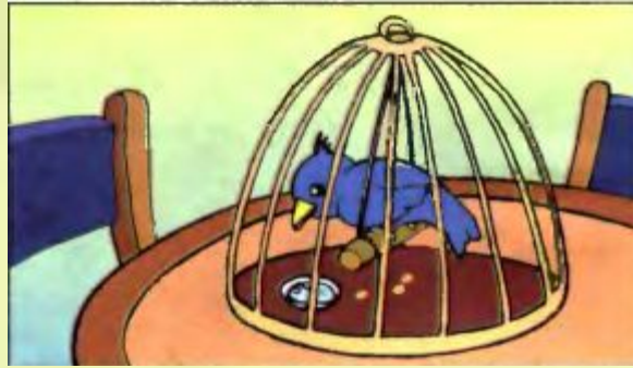
In the cage