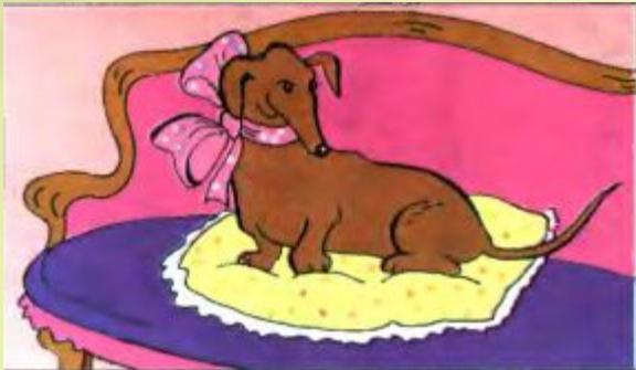
In the house