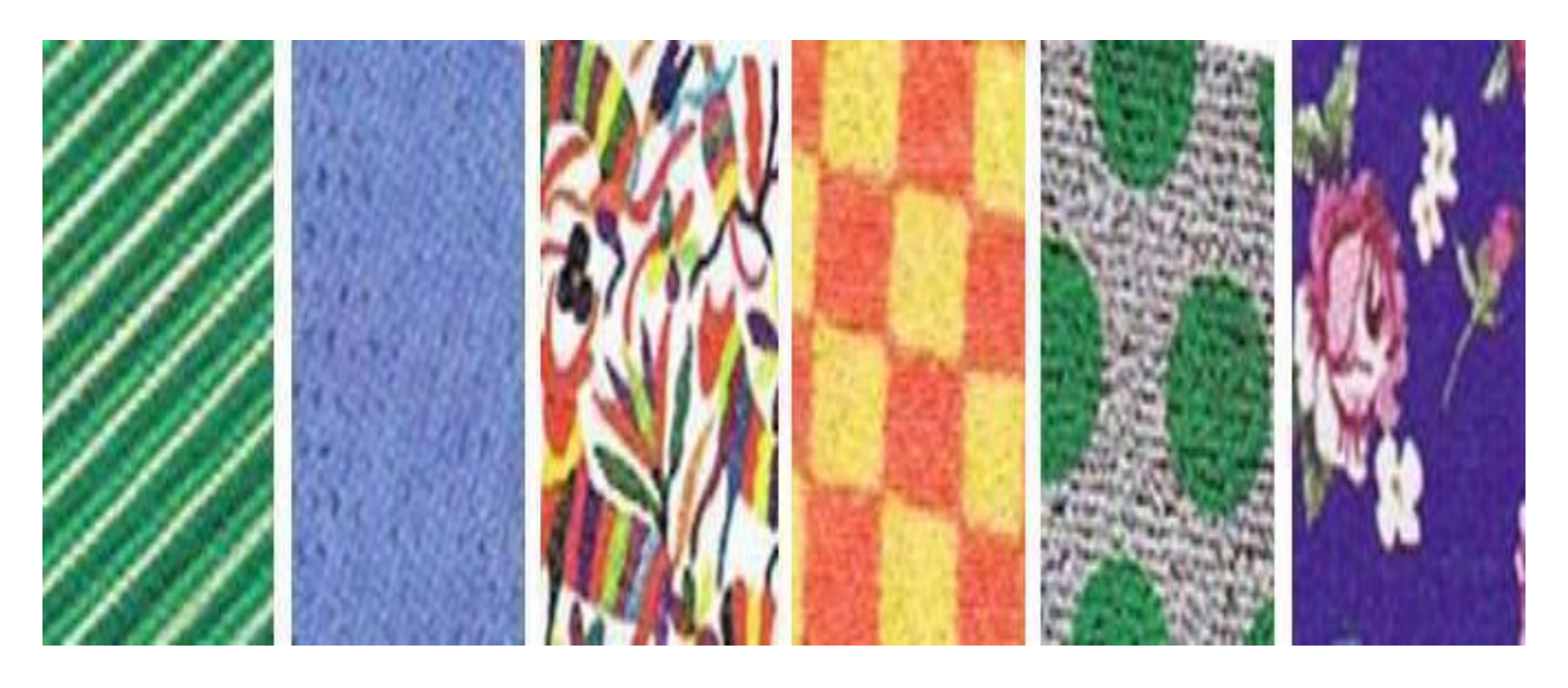
Striped - plain - patterned - checked - polka-dot - floral