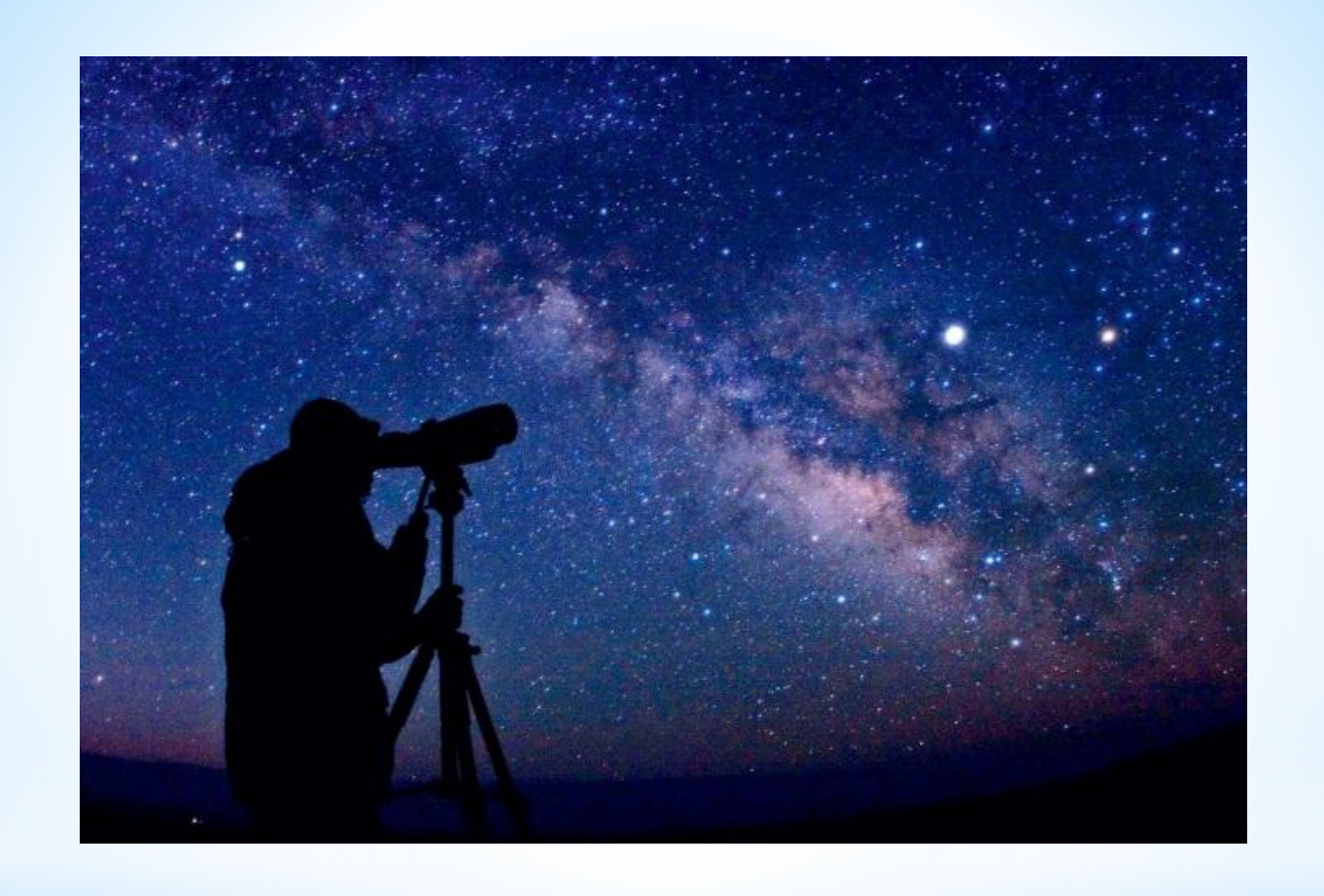
He is looking at the stars.