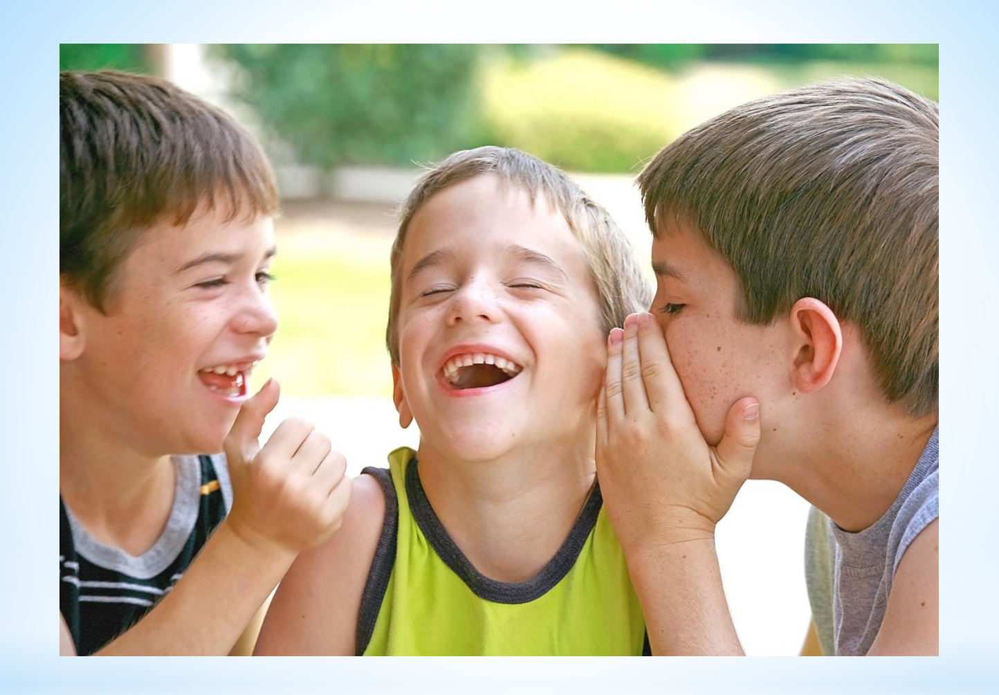
They are talking.