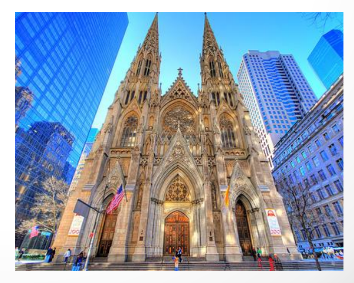
St. Patrick's Cathedral