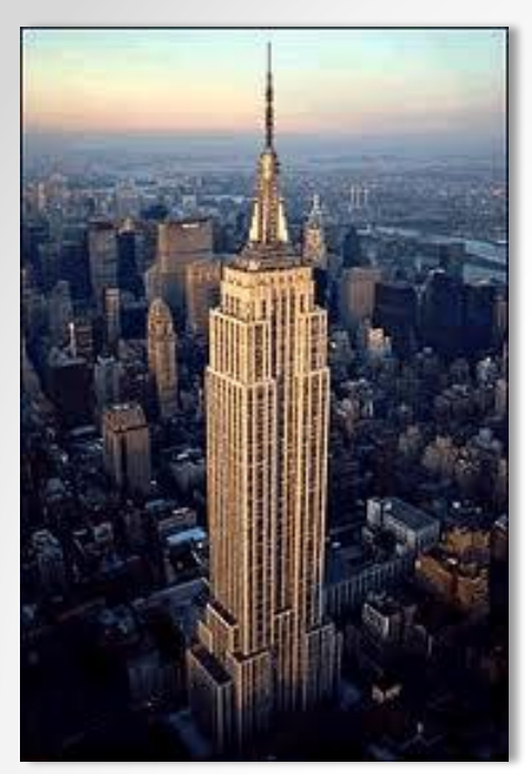
The Empire State Building