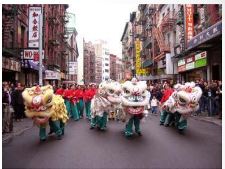
"Little Italy" Neighborhood •