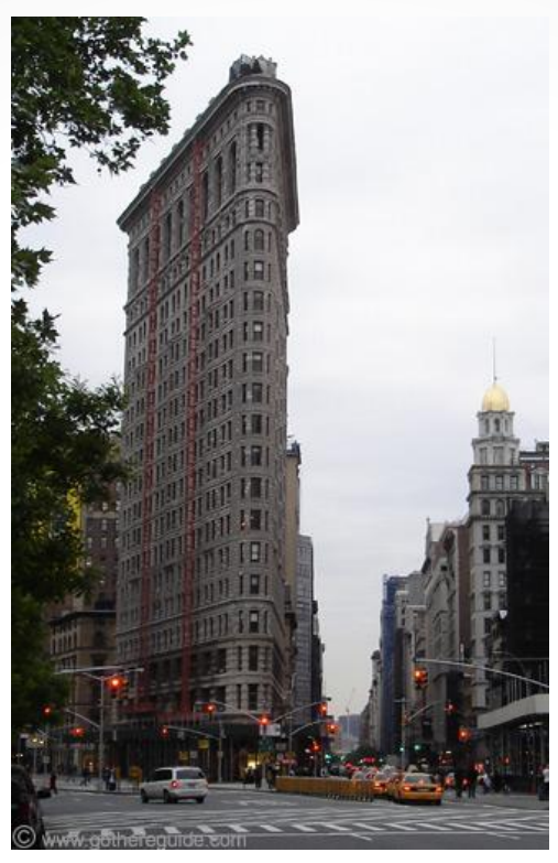
The Flatiron Building