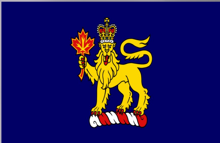
Flag of governor General of Canada