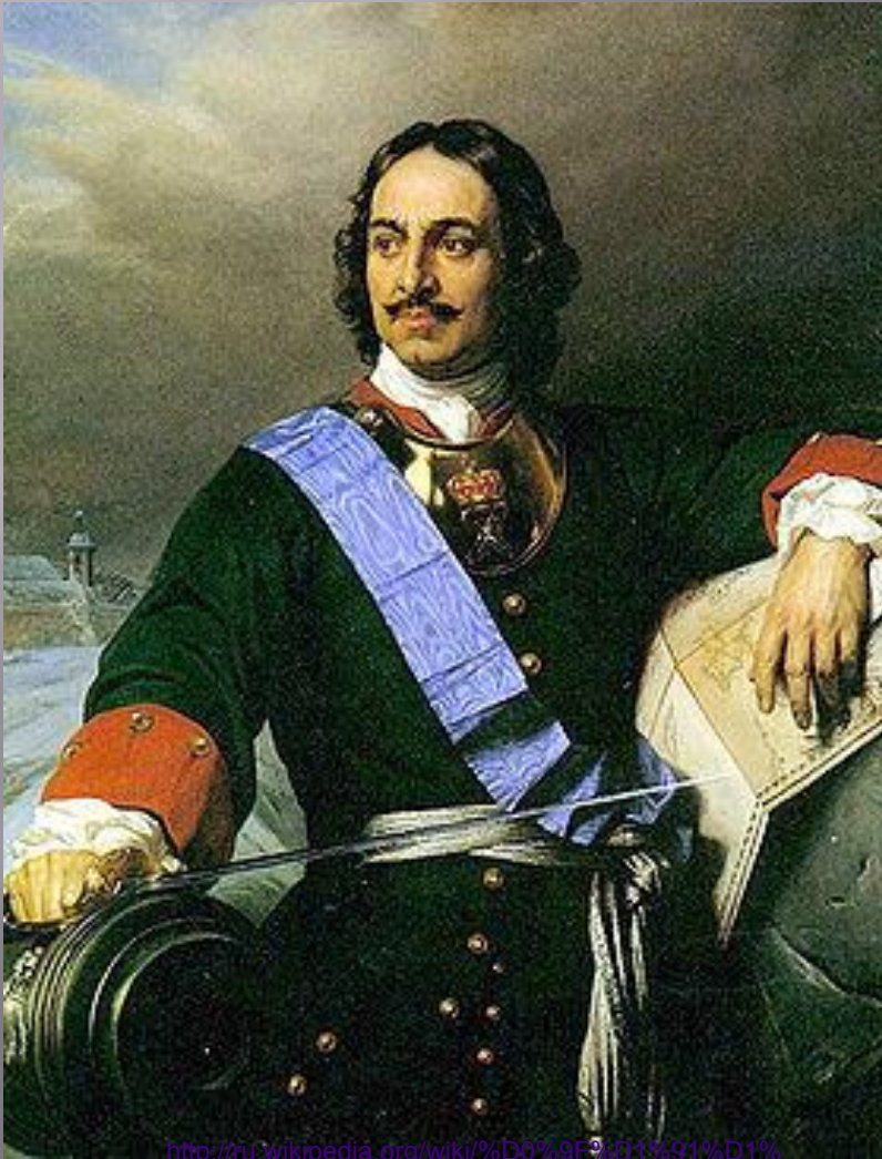
Peter the Great

http://ru.wikipedia.org/wiki/%D0%9F%D1%91%D1%82%D1%80 |