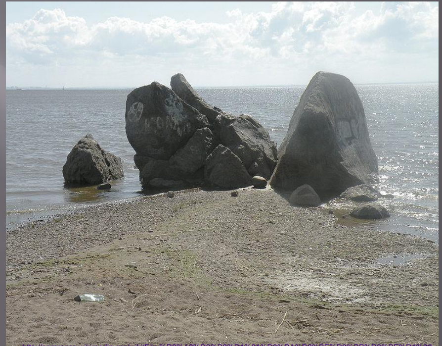
Chopped valun. Suppositional splinter of Thunder-stone