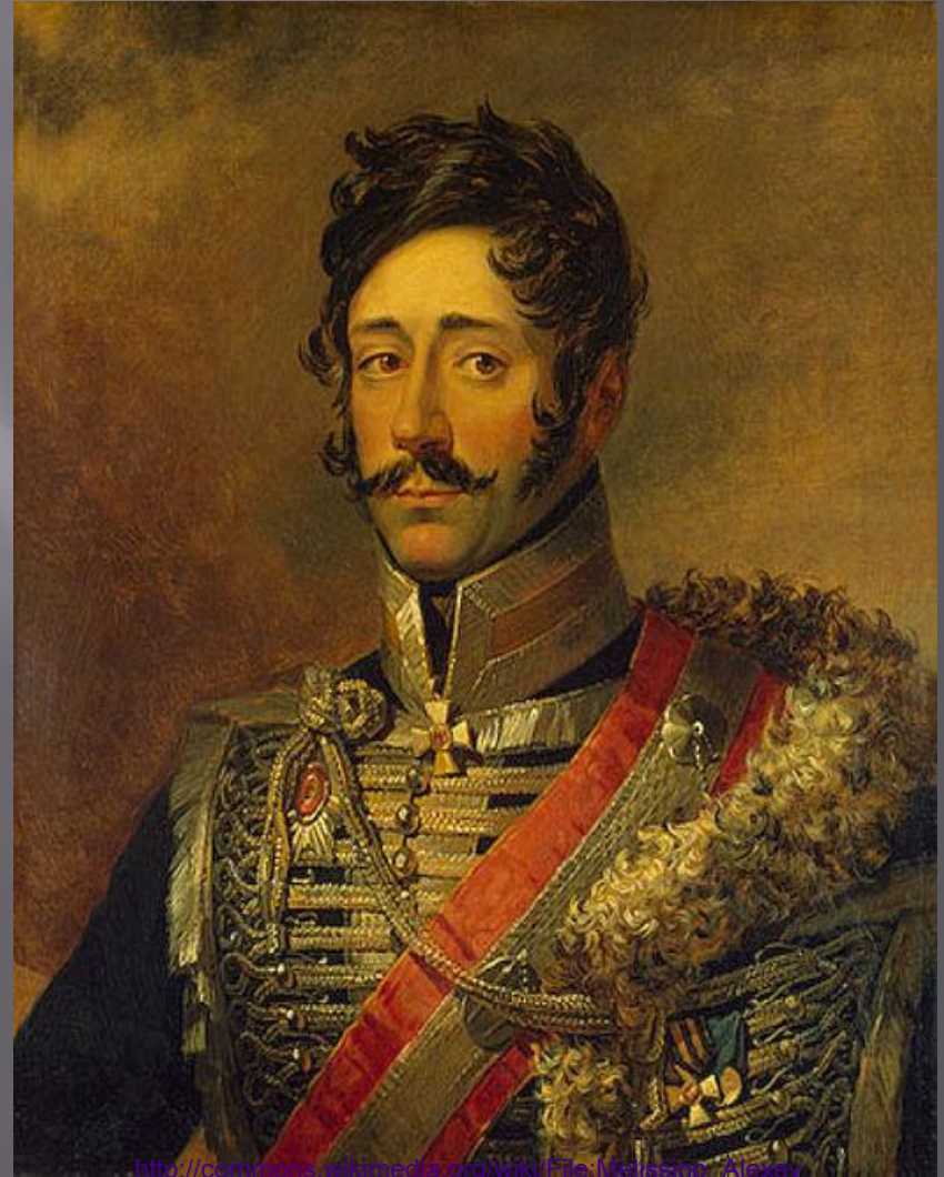
Melissino Alexey Petrovich

http://commons.wikimedia.org/wiki/File:Melissino_Alexey_Petrovich.jpg?uselang=ru