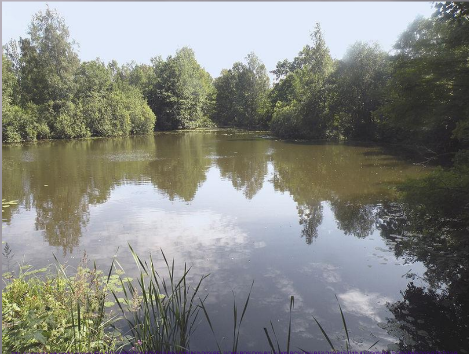
Lake on-site extraction of Thunder Stone

The granite block for the pedestal was found in the village of Lahta.